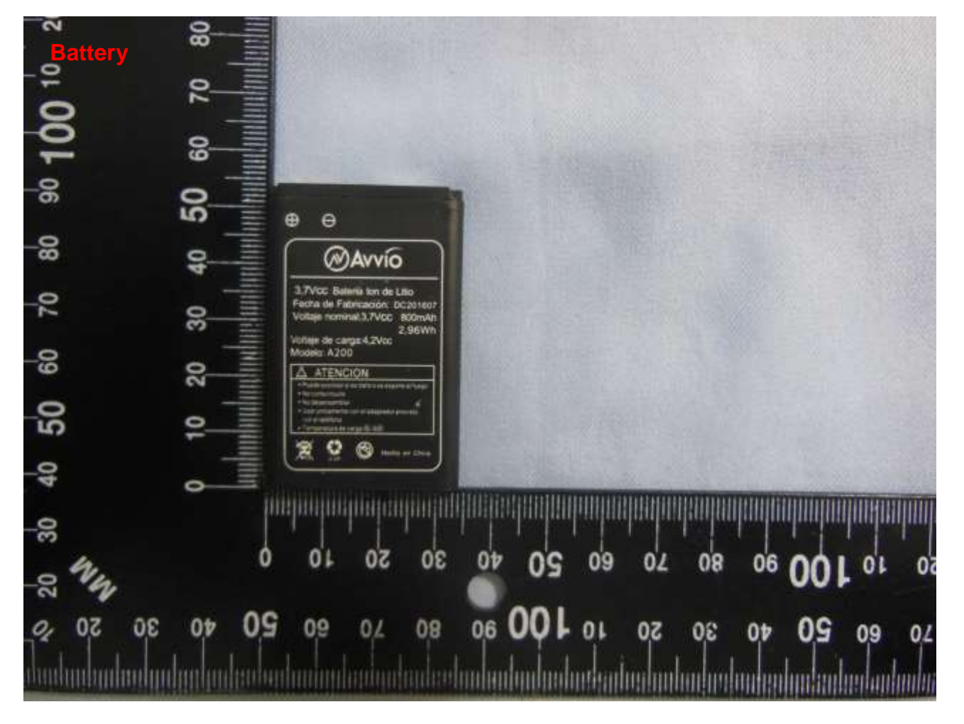
Brand Name: Avvio / Model Name: Avvio 200S, Avvio 200