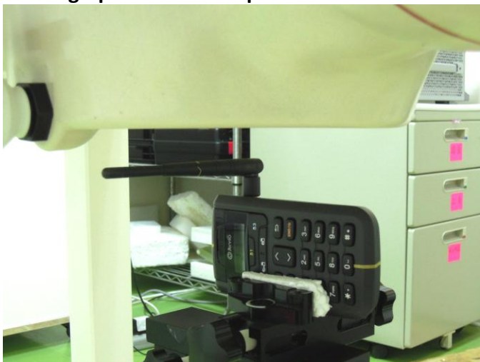
Vertical Antenna with 2.5 cm Gap