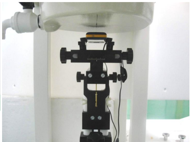
Bottom of the DUT with Phantom 1.5 cm Gap