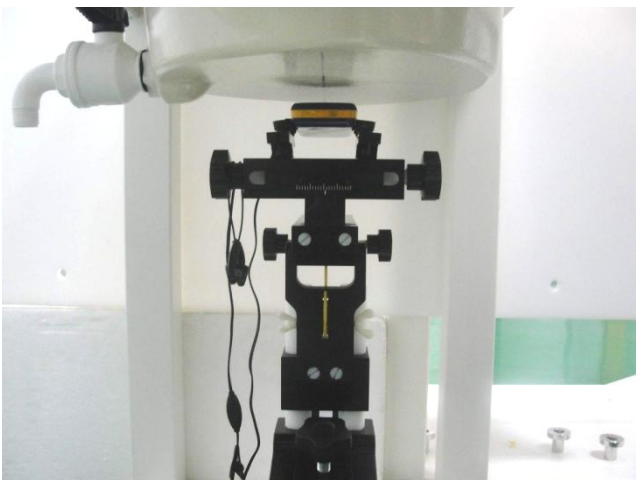
Face of the DUT with Phantom 1.5 cm Gap