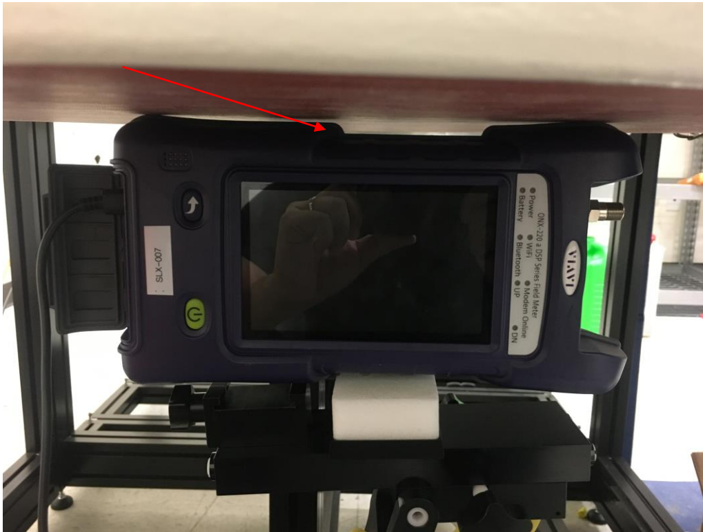
Left side Position