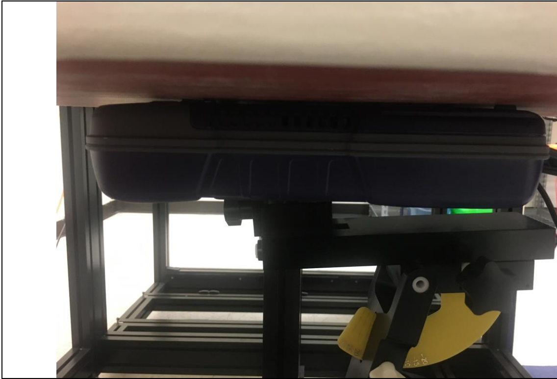
Back side Position