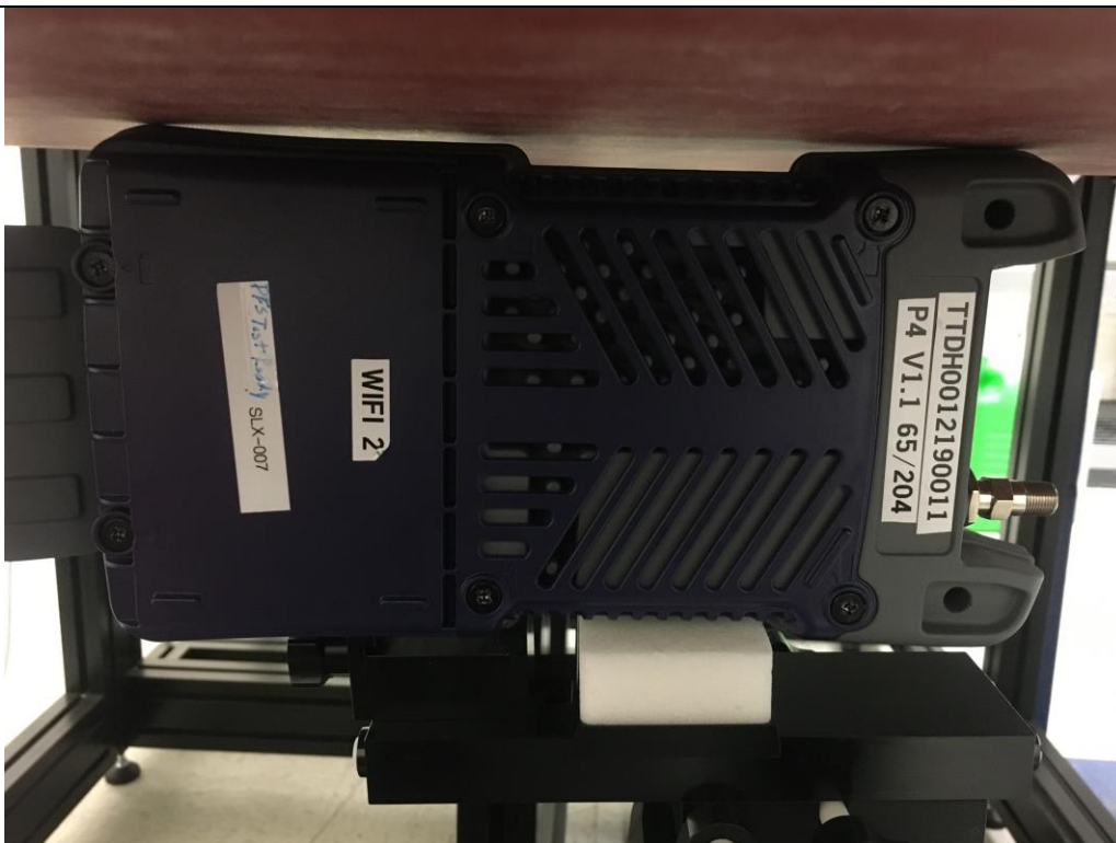
Right side Position