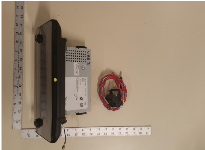
Figure B1: DUT Sample