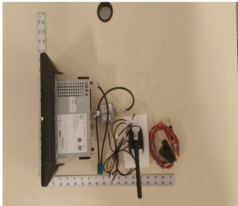
Figure B4: DUT Samples