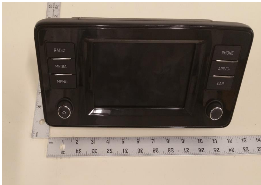
Figure B2: DUT Front view