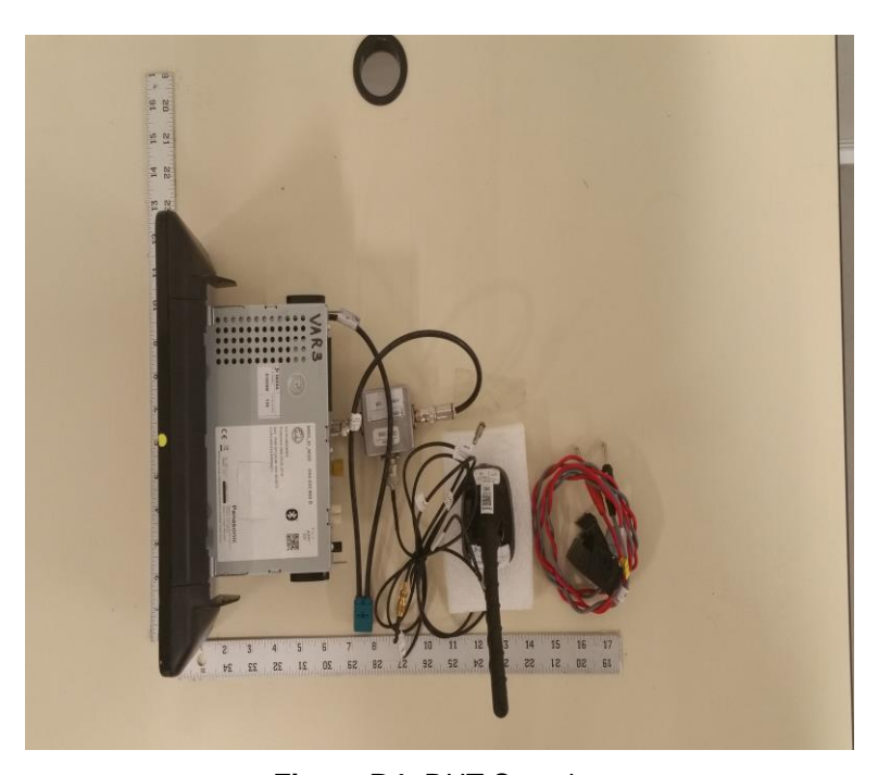
Figure B4: DUT Samples