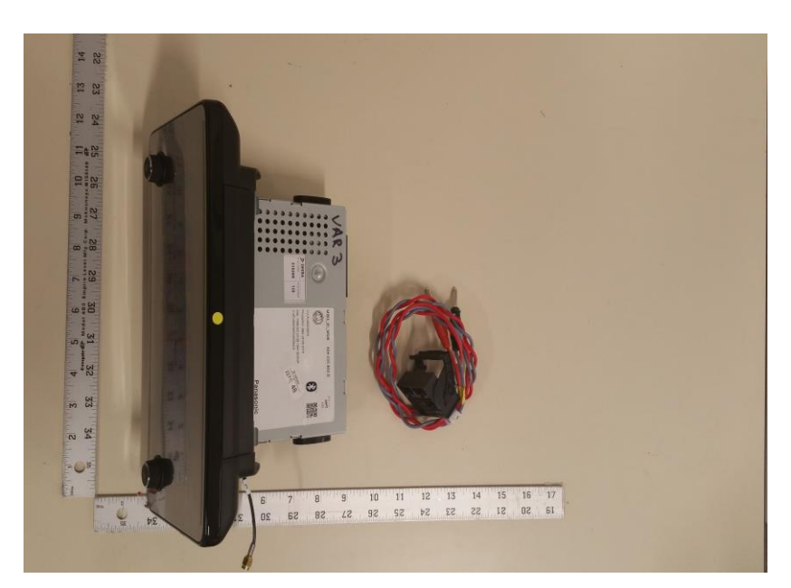
Figure B1: DUT Sample