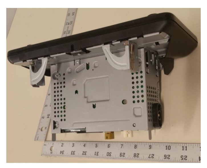
Figure B3. DUT Rear view