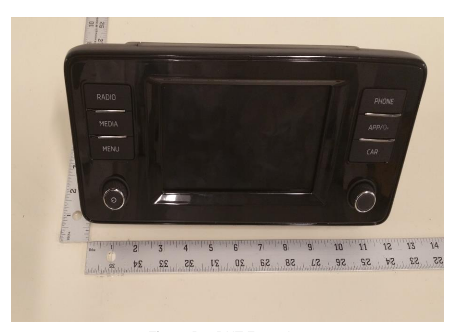
Figure B2: DUT Front view