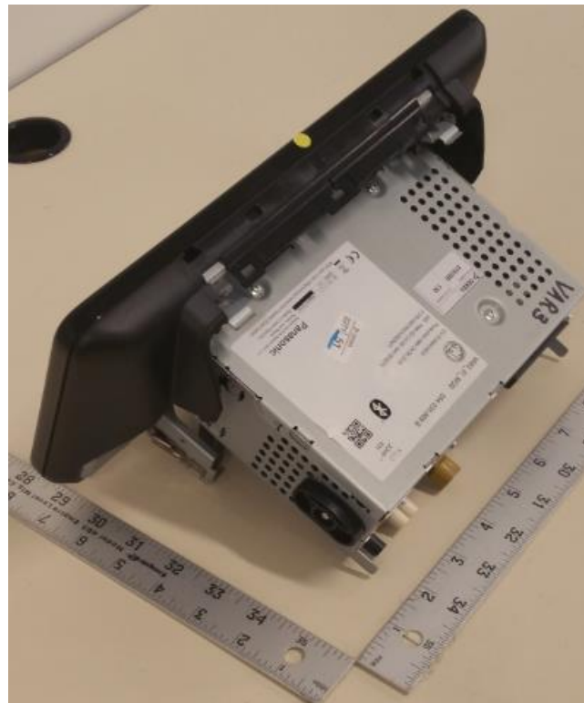
Figure B2. DUT Side Rear view1