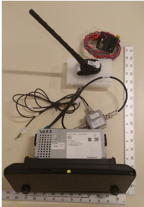
Figure B1. DUT Front view