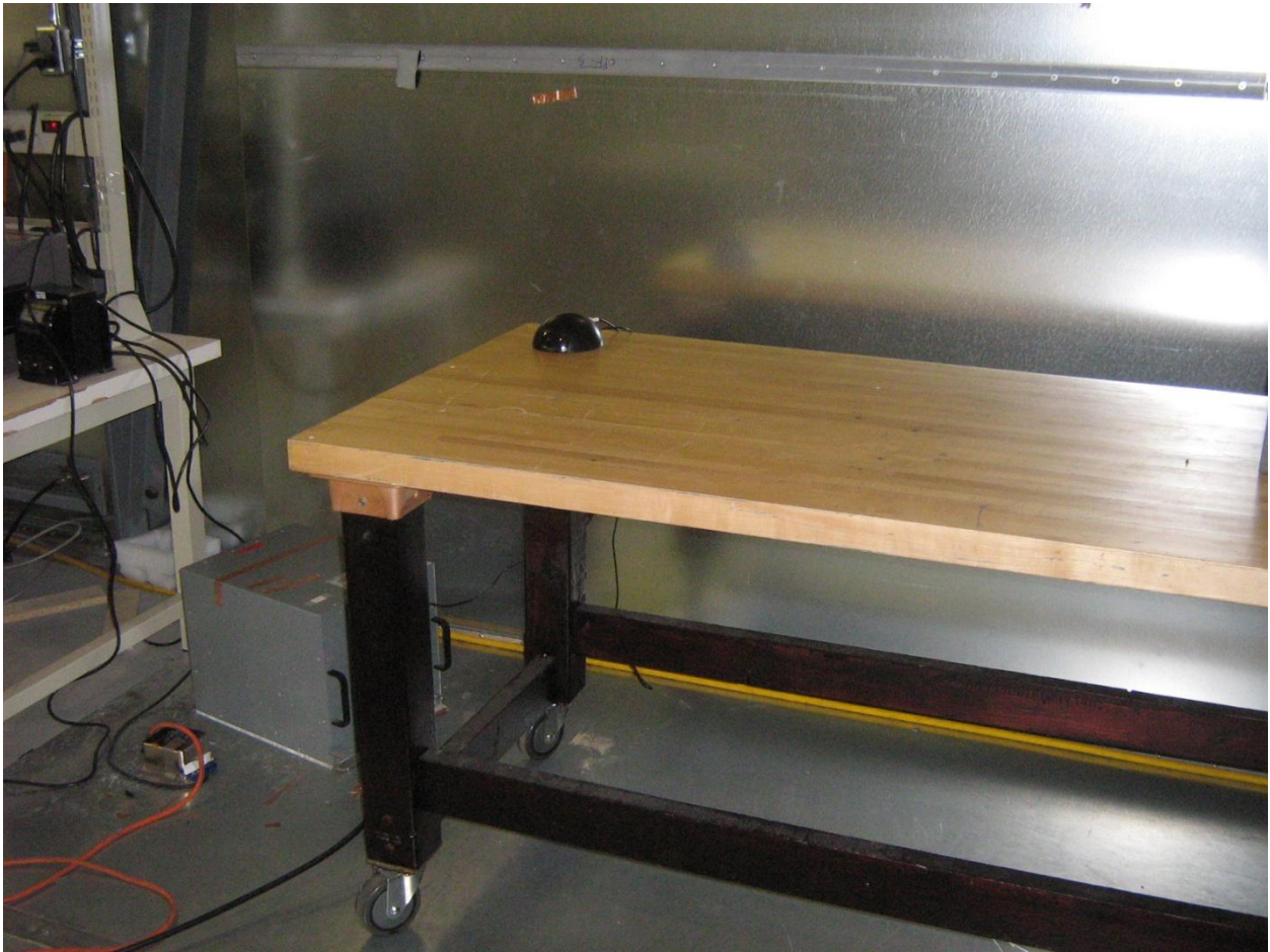
Figure 2: Conducted emissions setup