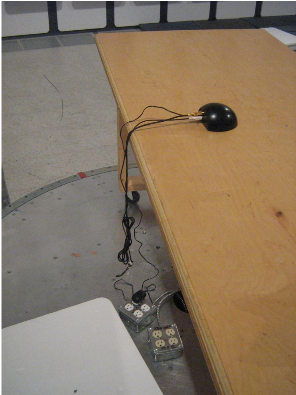
Figure 1: Radiated spurious emissions on module