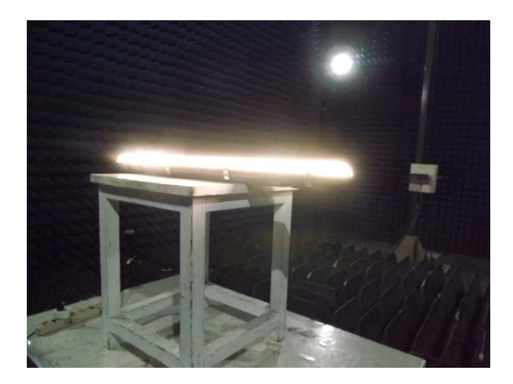
Test frequency above 1GHz at test site 1#

Waltek Services (Shenzhen) Co.,Ltd. http://www.waltek.com.cn