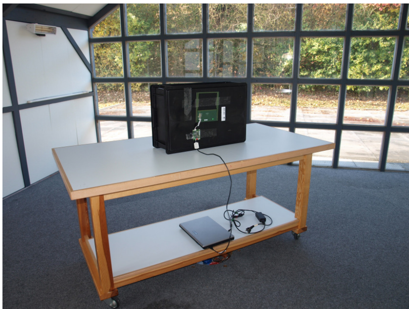
Picture 1-2: EUT test setup open site for spectrum mask and radiated emission test