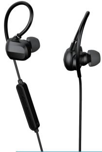
EN Sport Bluetooth Headset Model:G15B