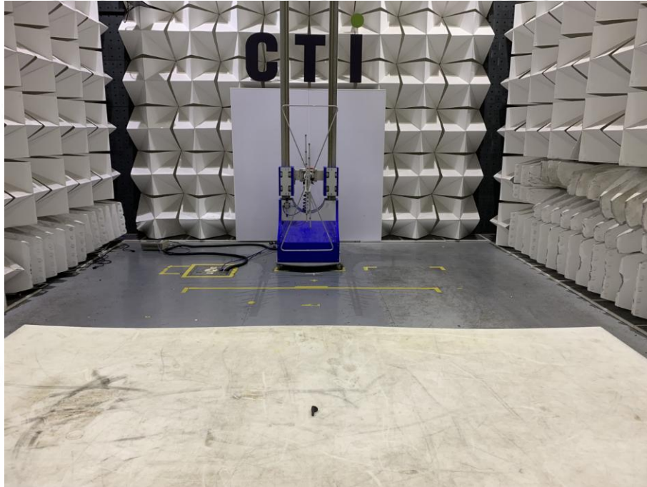
Radiated spurious emission Test Setup-1 right ear(Below 1GHz)