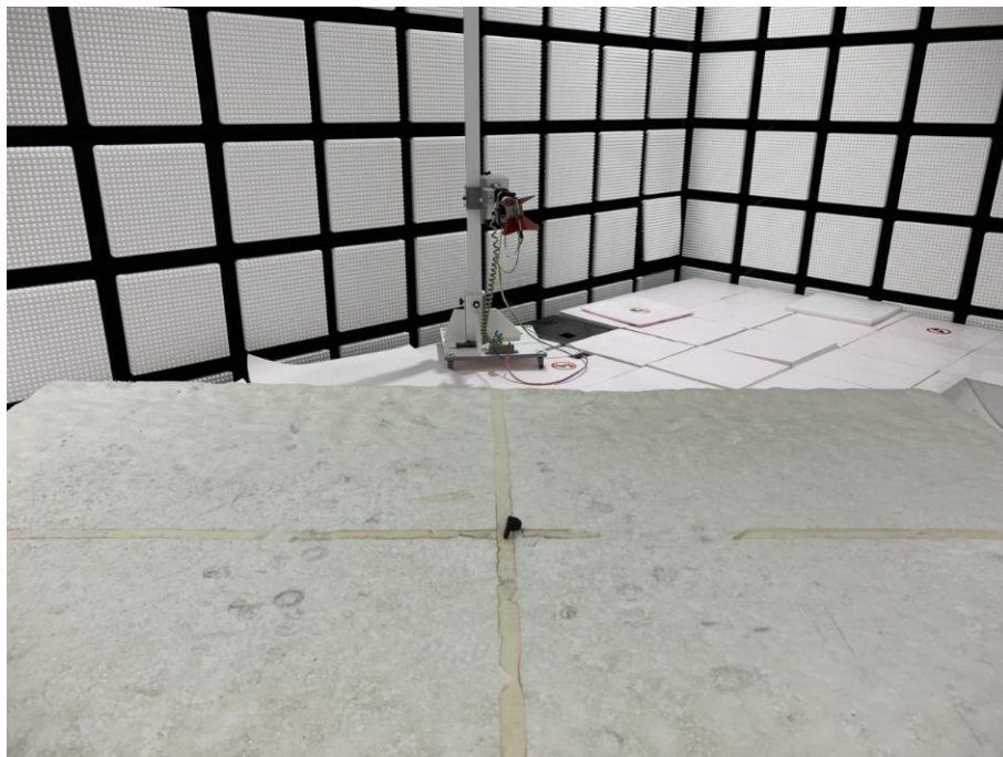
Radiated spurious emission Test Setup-2 right ear(Above 1GHz)