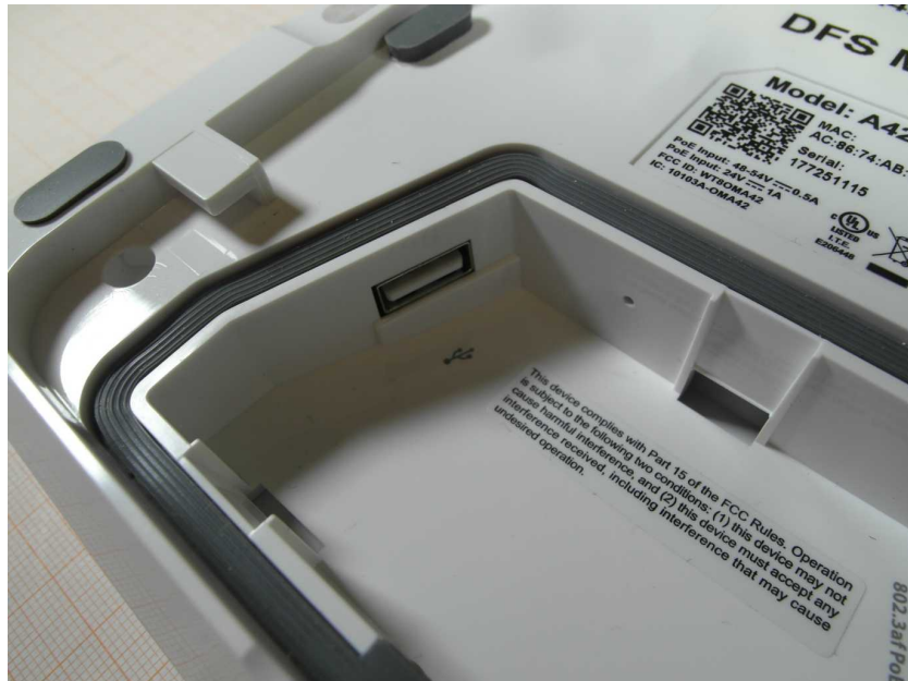
Photo 9 EUT connectors