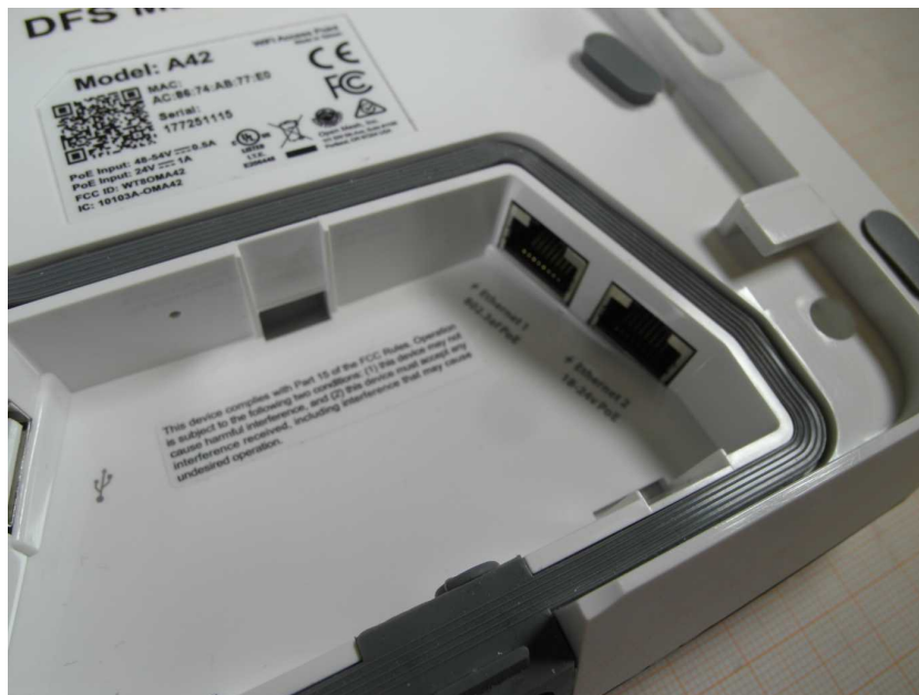
Photo 8 EUT connectors