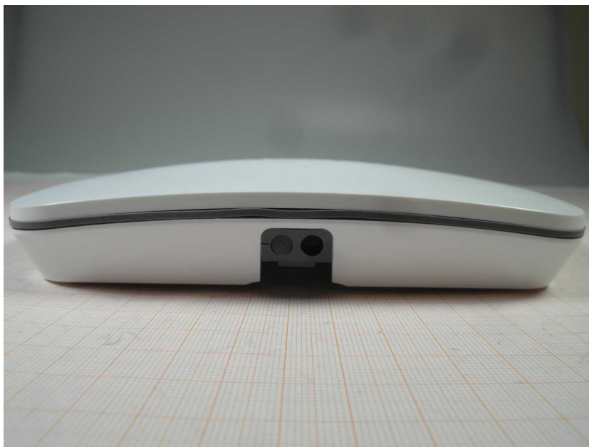
Photo 2 EUT side view