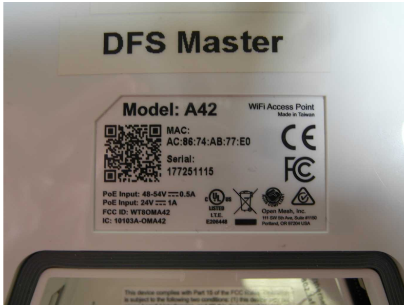
Photo 7 EUT label view