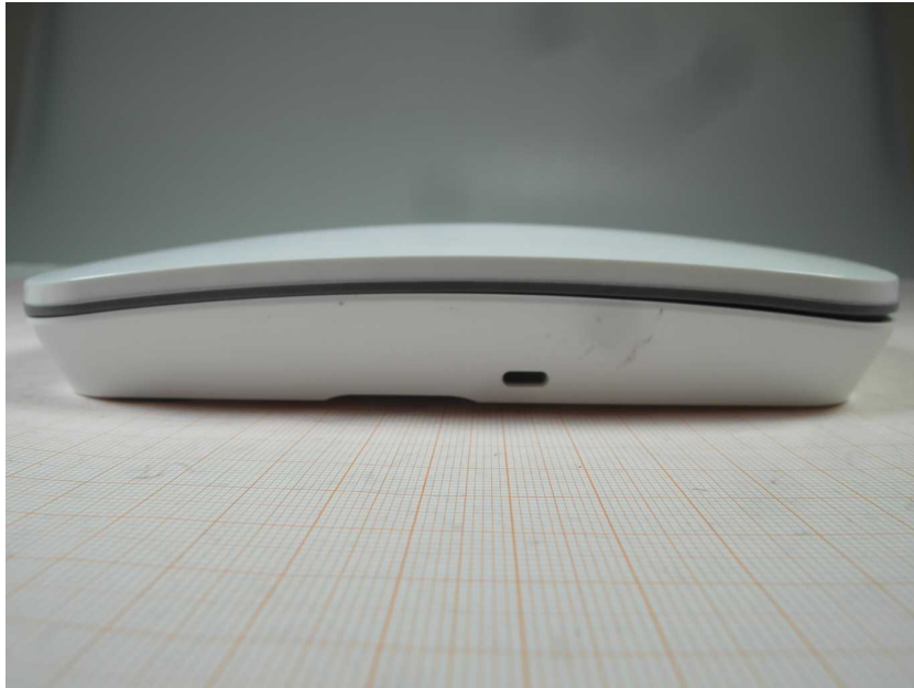
Photo 3 EUT side view