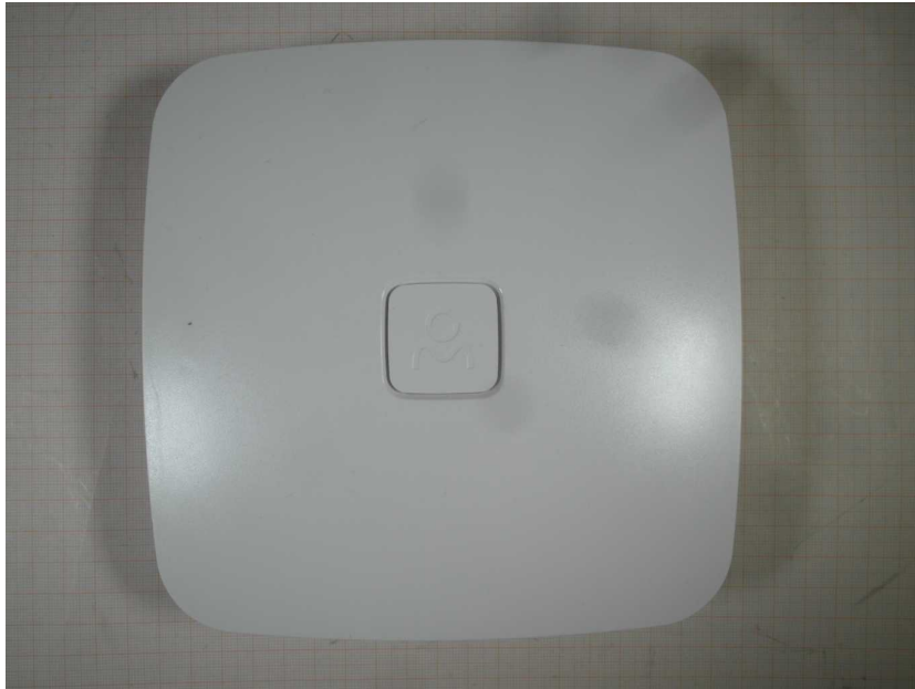
Photo 1 EUT top view