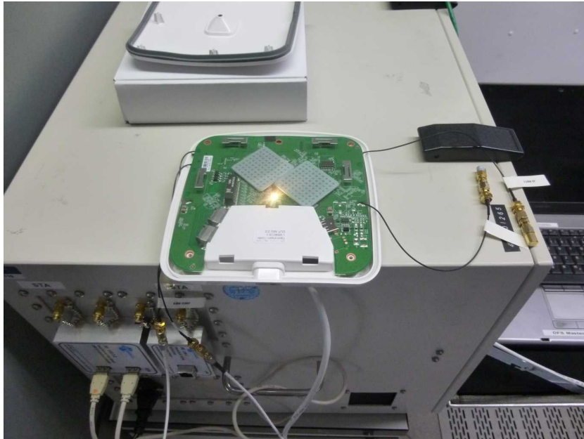
Photo 5 client setup detailed