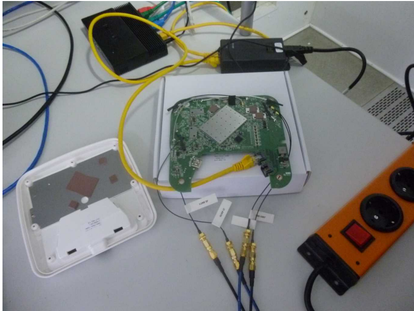
Photo 3 EUT setup detailed