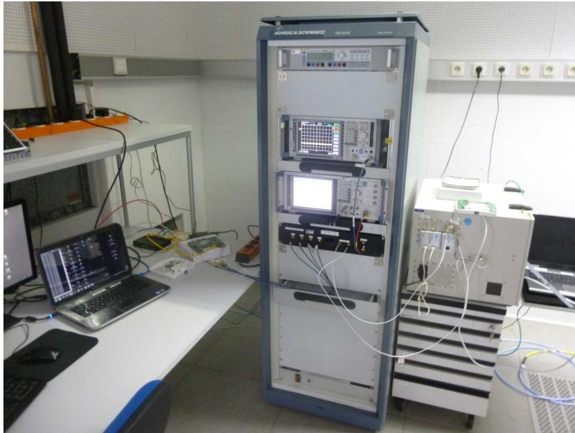
Photo 1 measurement setup