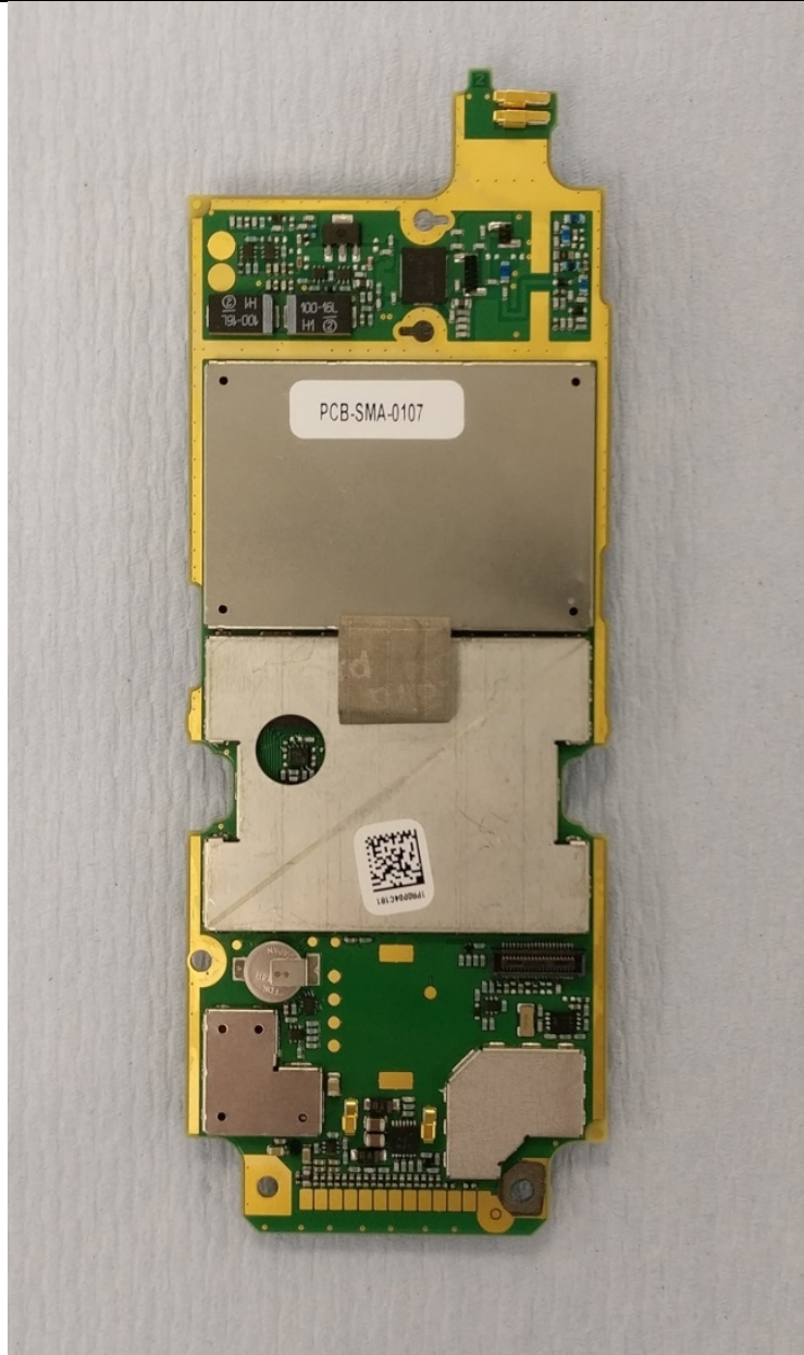
HTT-500-2 PCB LCD side with screening cans