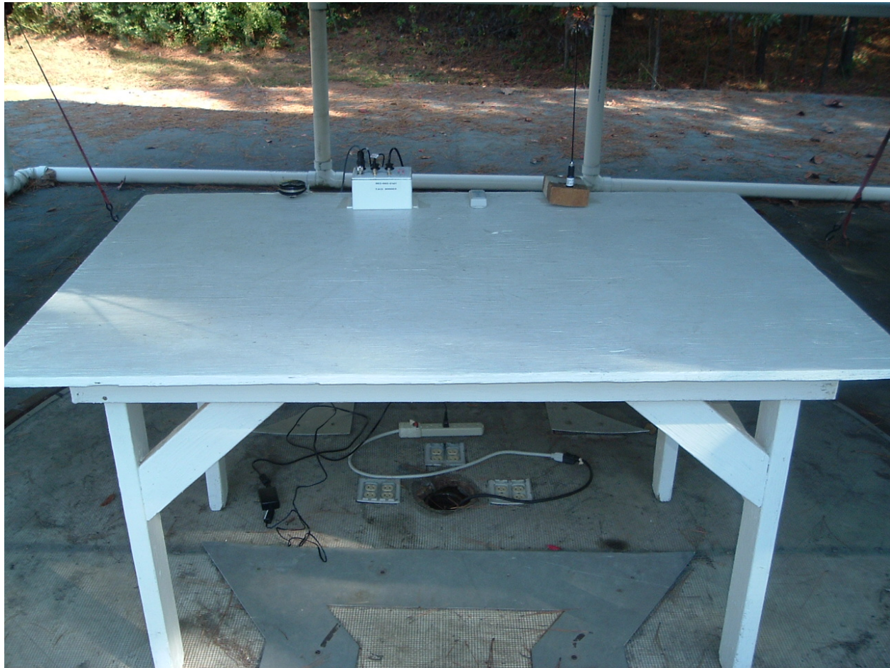
Figure 2. Photograph of Test Setup for Spurious and Fundamental Emissions Measurement, (Front View)