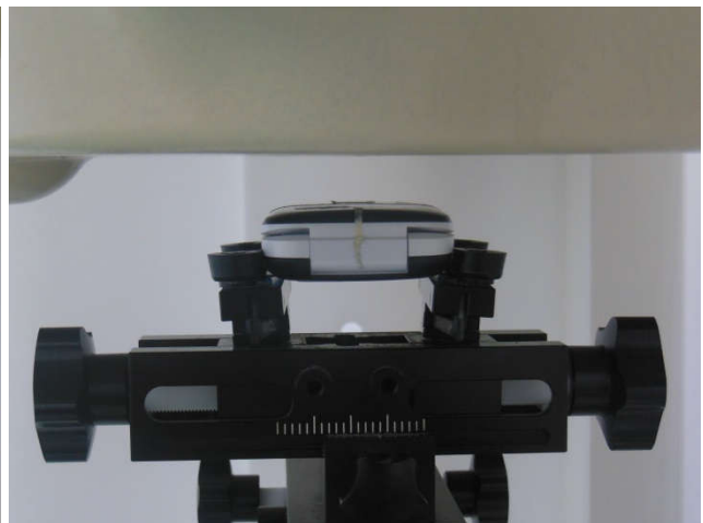
Front, Test Separation 15 mm (Flip Close)