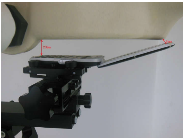
Left Cheek-SAR in mouth area(Flip Open)