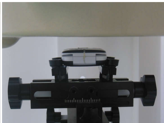
Front of the DUT with Phantom 1.5 cm Gap (Flip Close)