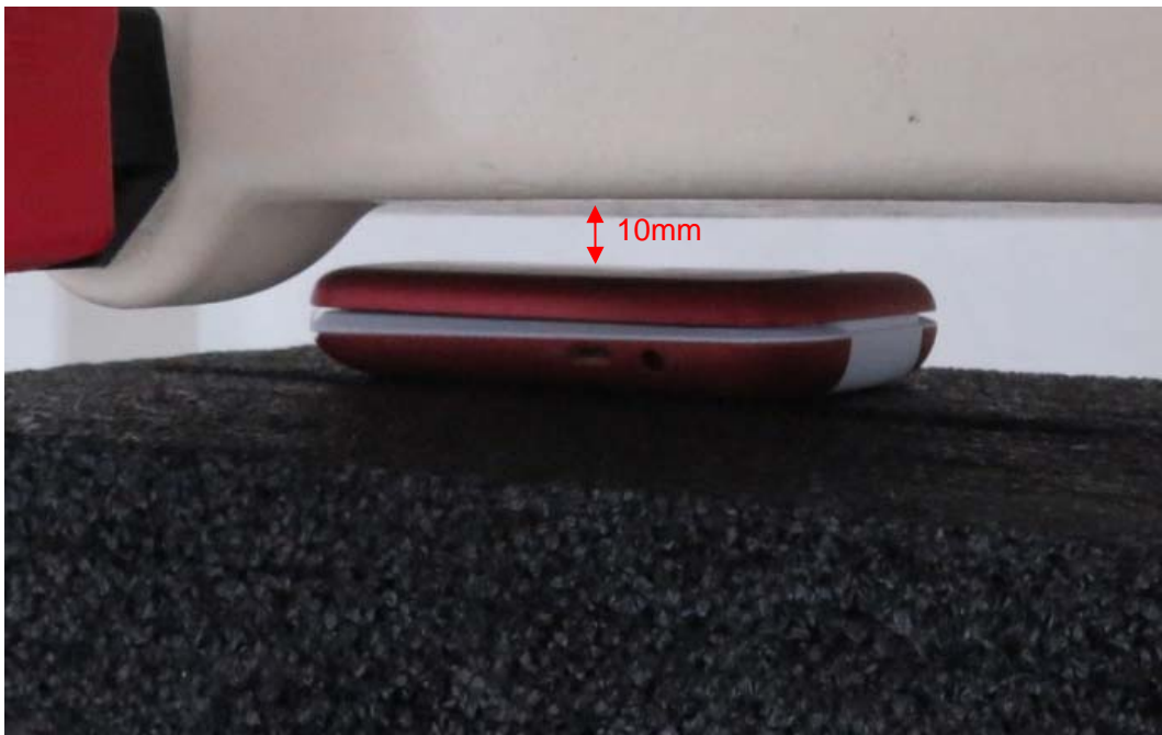
Picture 10: Front Side Close, the distance from handset to the bottom of the Phantom is 10mm