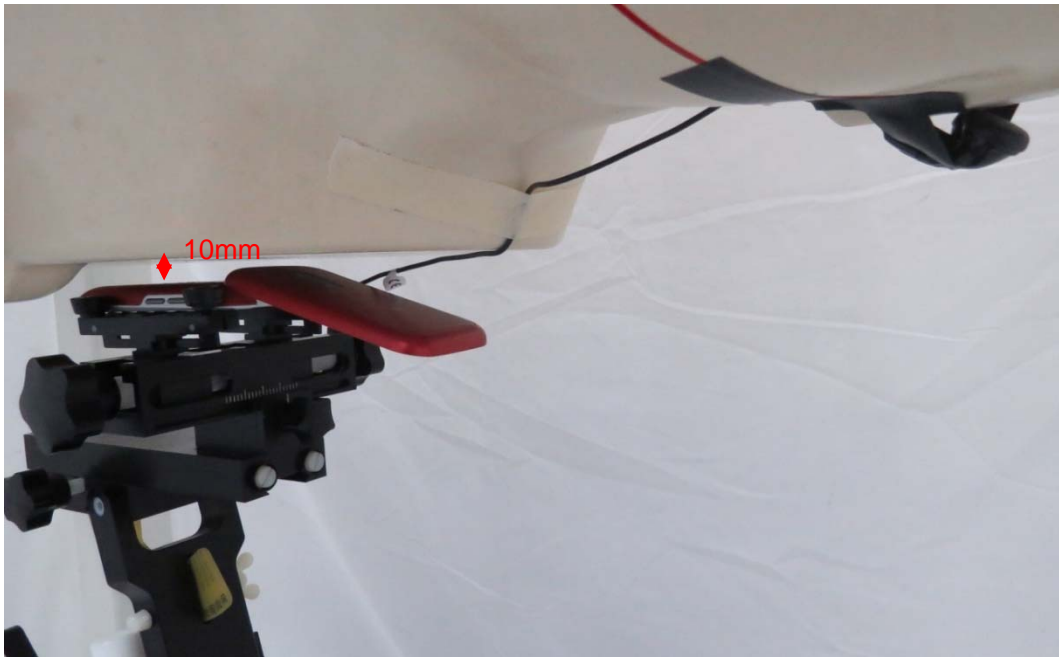
Picture 15: Back Side Open with Earphone, the distance from handset to the bottom of the Phantom is 10mm