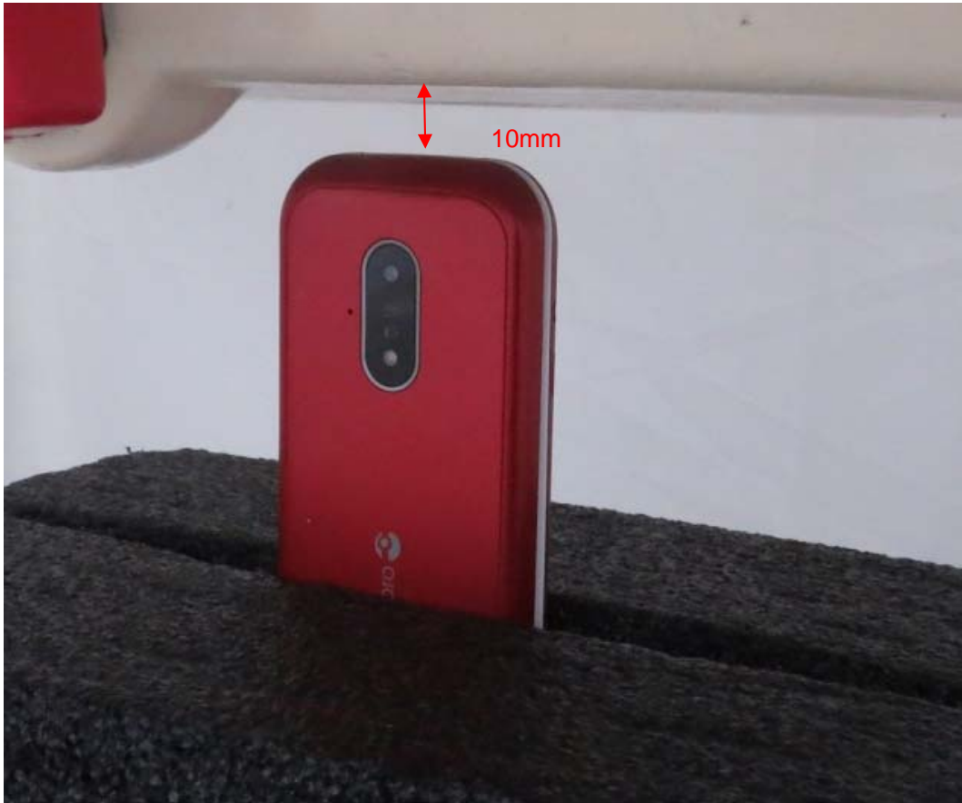
Picture 13: Top Side Close, the distance from handset to the bottom of the Phantom is 10mm