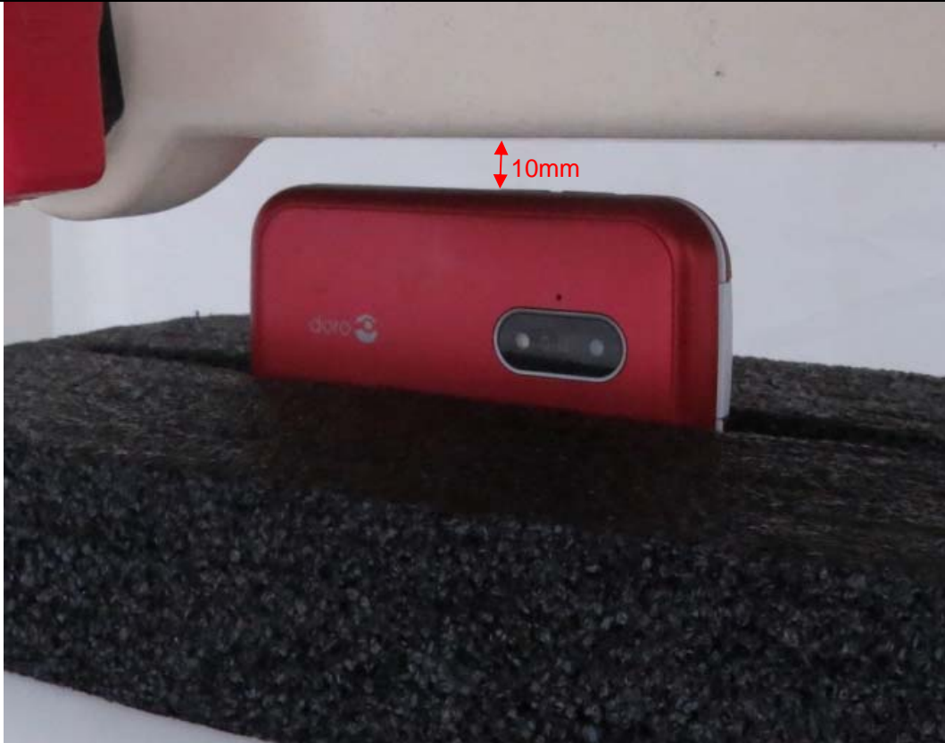
Picture 11: Left Side Close, the distance from handset to the bottom of the Phantom is 10mm