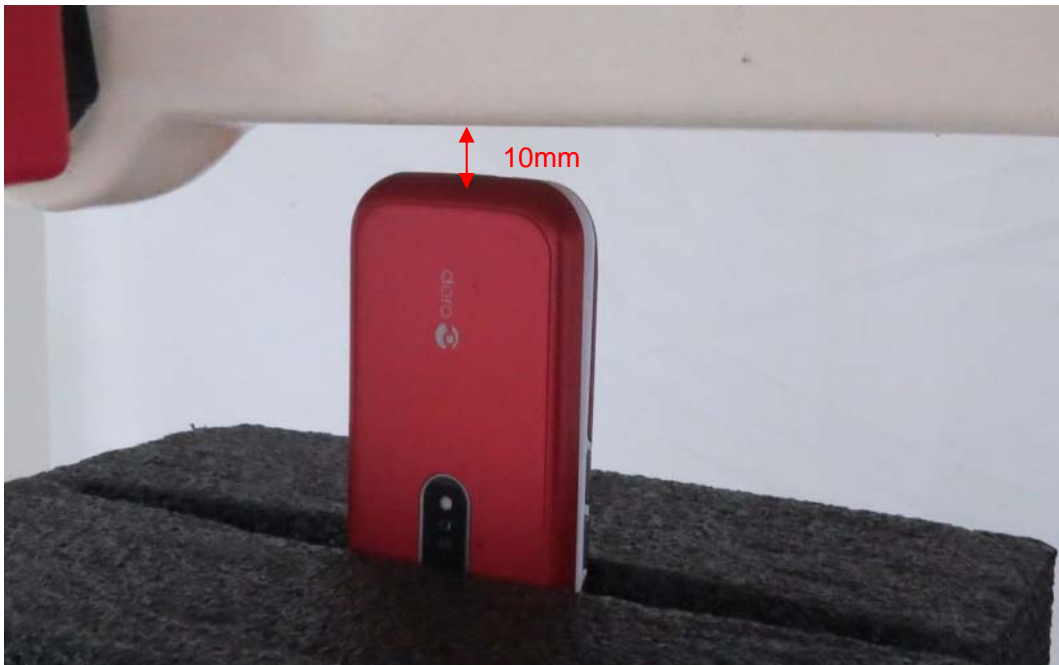
Picture 14: Bottom Side Close, the distance from handset to the bottom of the Phantom is 10mm