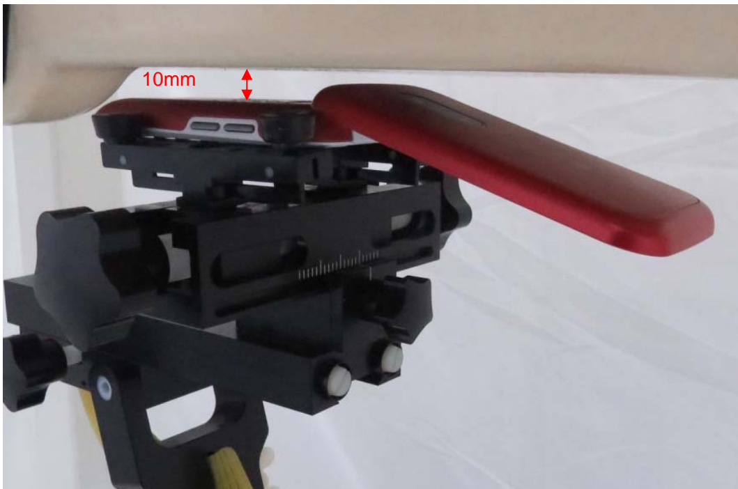
Picture 8: Back Side Open, the distance from handset to the bottom of the Phantom is 10mm