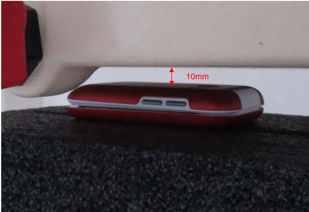
Picture 9: Back Side Close, the distance from handset to the bottom of the Phantom is 10mm