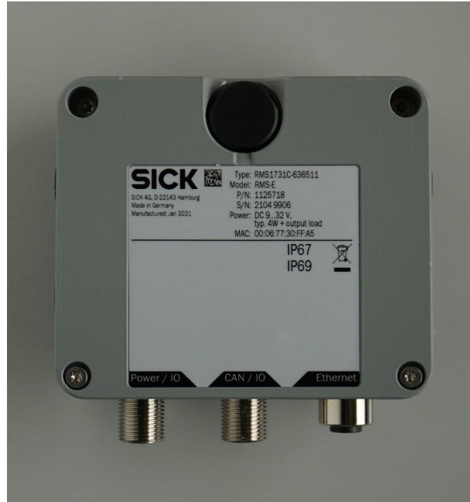
*informative: new label