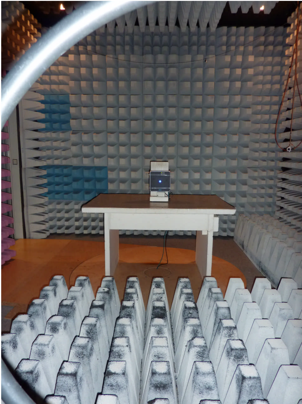
113961_h1.JPG: EUT with internal antenna, test set-up fully anechoic chamber