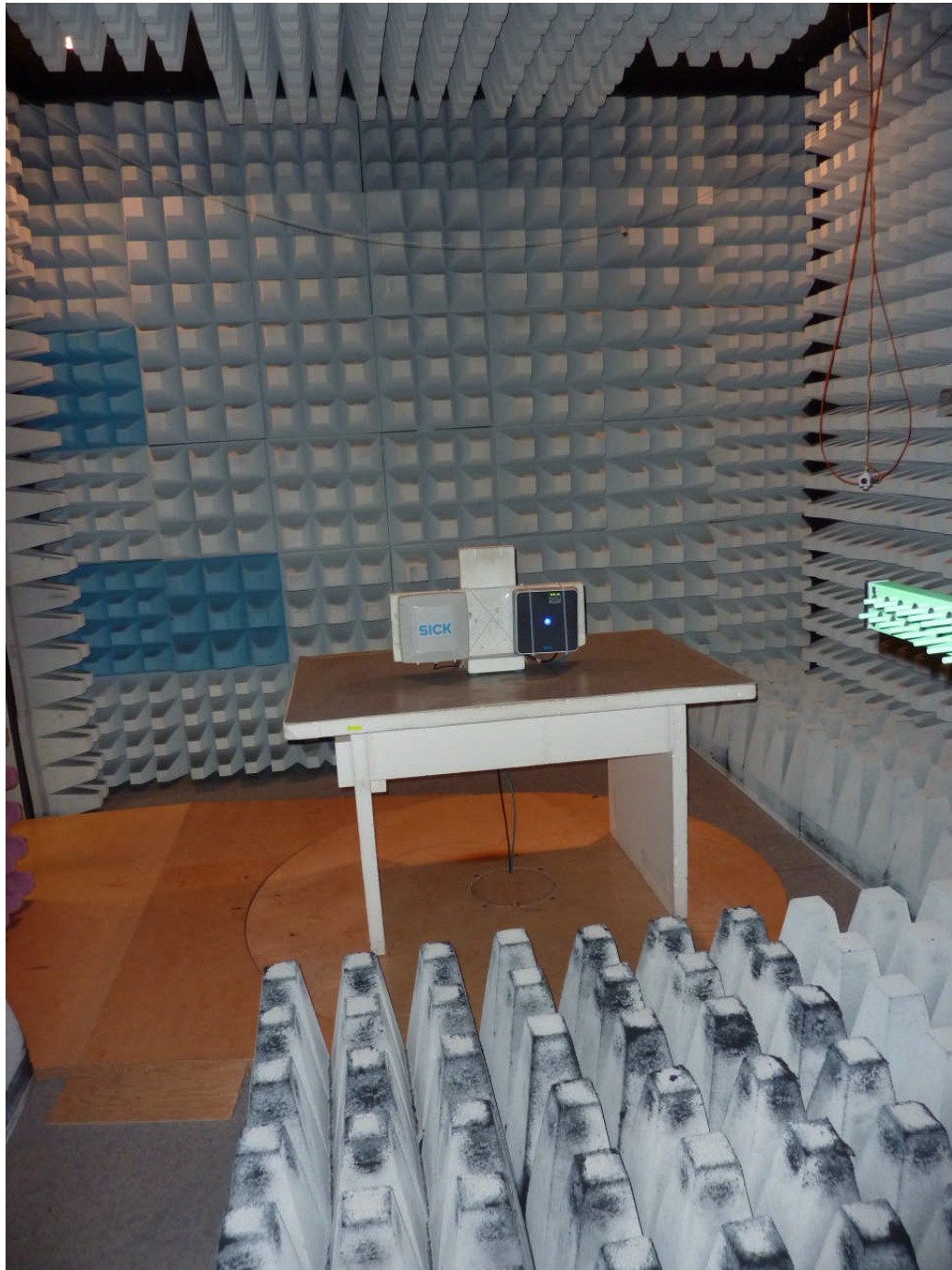
113961_t.JPG: EUT with external patch antenna, test set-up fully anechoic chamber