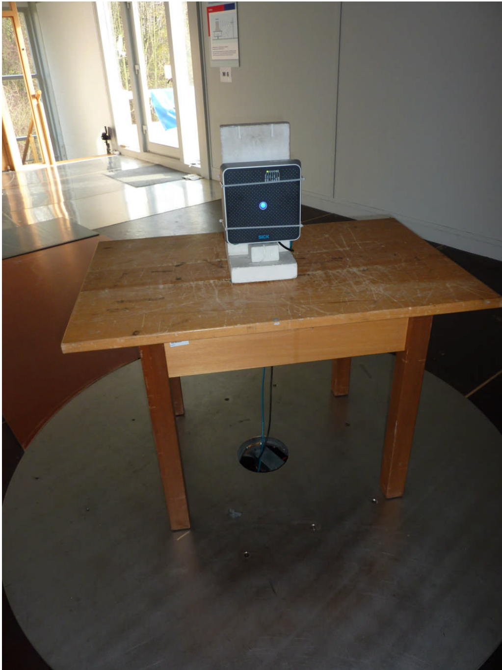
113961_d1.JPG: EUT with internal antenna, test set-up open area test site