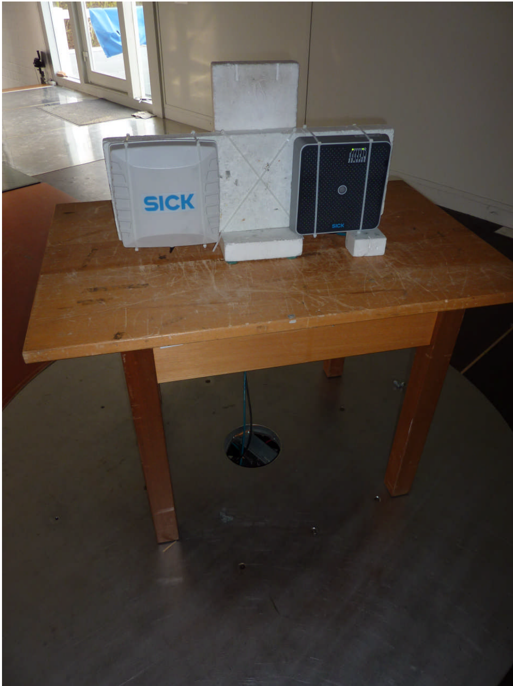
113961_c1.JPG: EUT with external patch antenna, test set-up open area test site