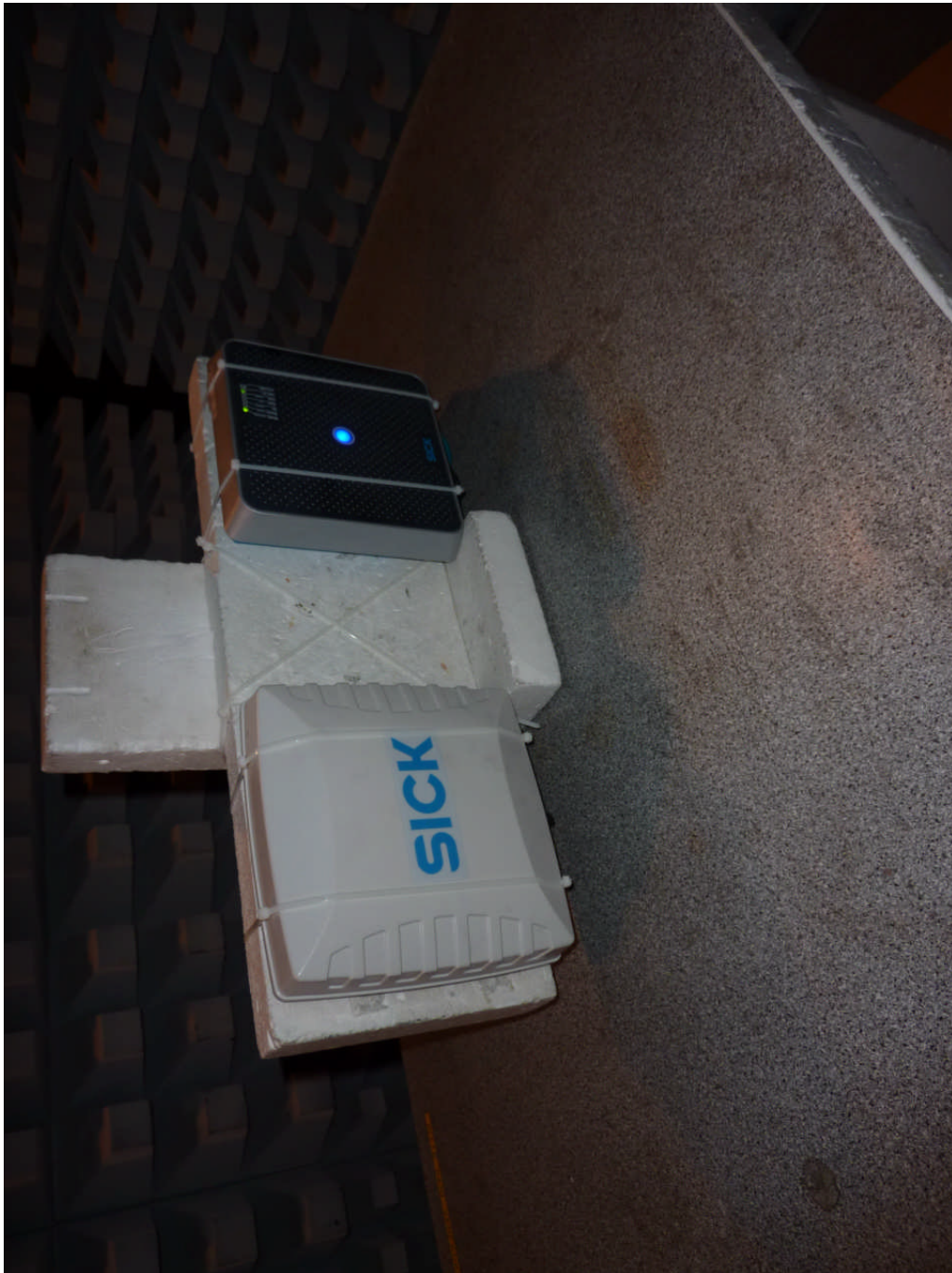
113961_o.JPG: EUT with external patch antenna, test set-up fully anechoic chamber