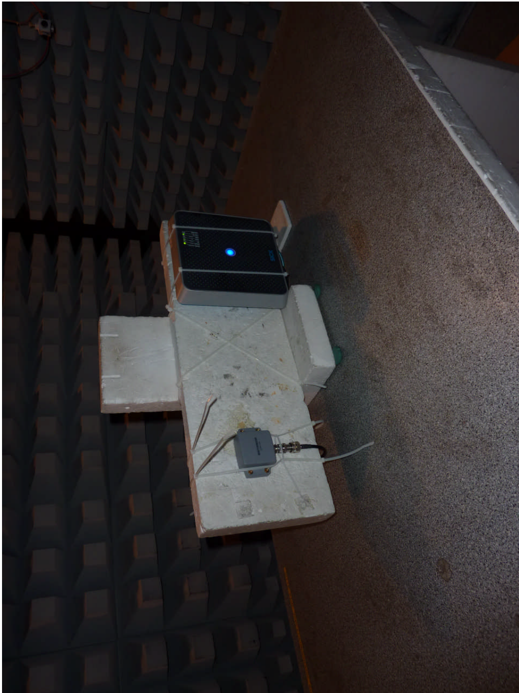
113961_w.JPG: EUT with external ULORA antenna, test set-up fully anechoic chamber