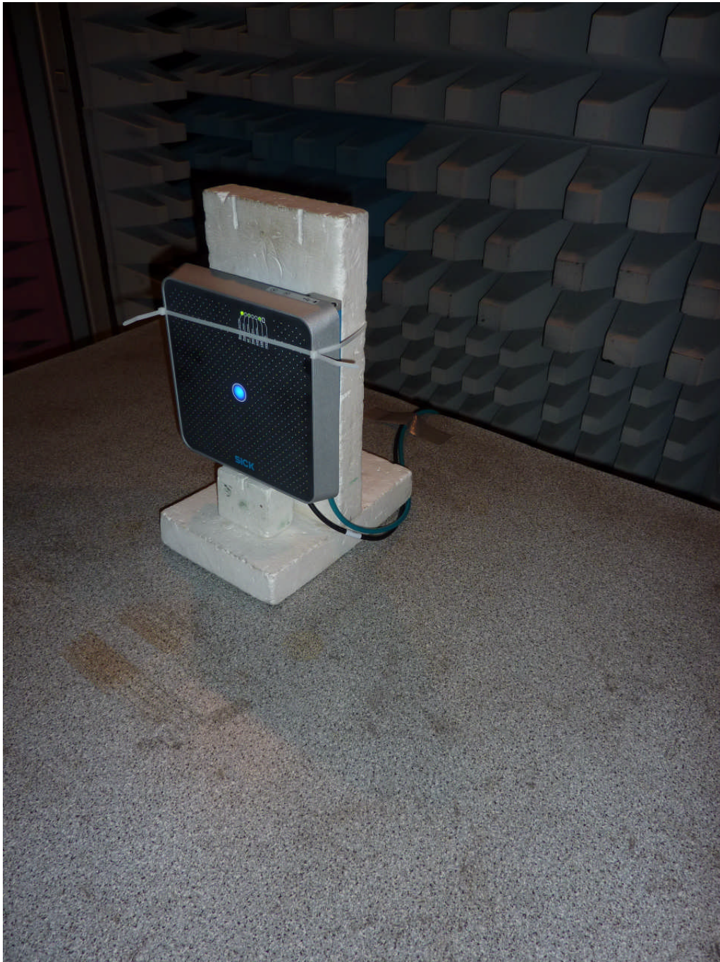
113961_I.JPG: EUT with internal antenna, test set-up fully anechoic chamber