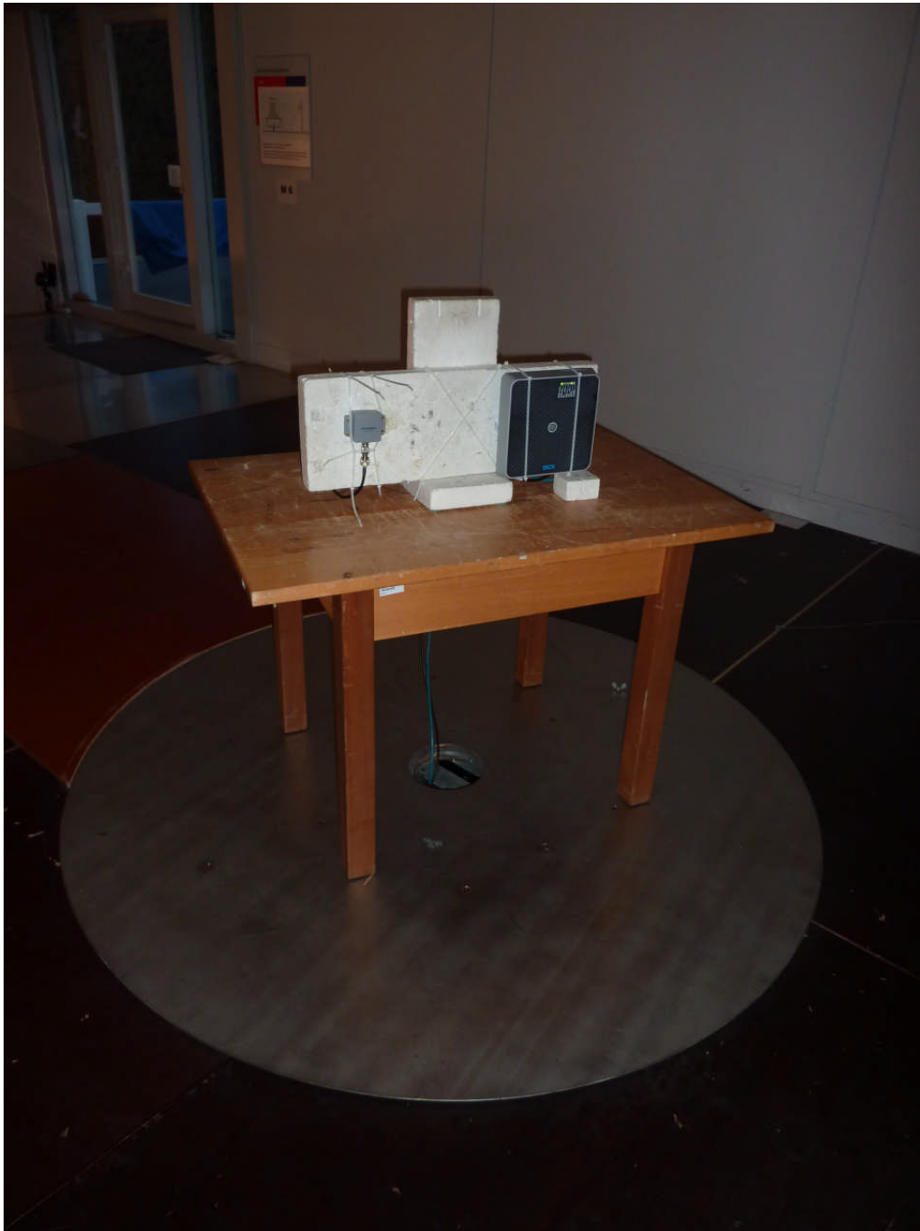
113961_z.JPG: EUT with external ULORA antenna, test set-up open area test site