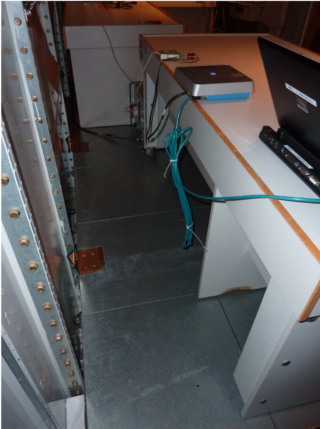
113961_j1.JPG: Test set-up shielded room