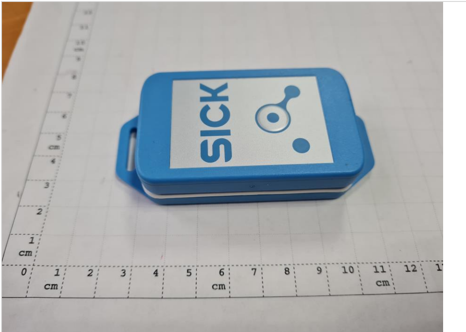
Photograph 3: EUT 01_Left side view