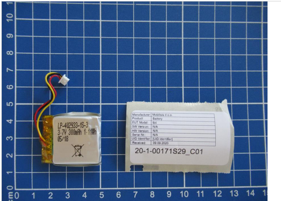
Photograph 1: AE 01