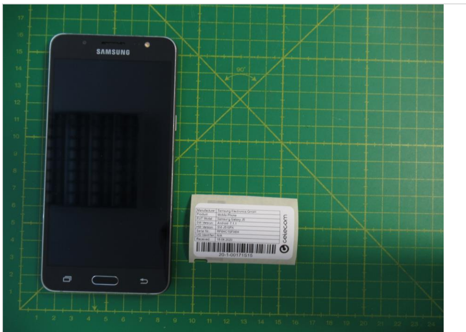
Photograph 2: AE 02