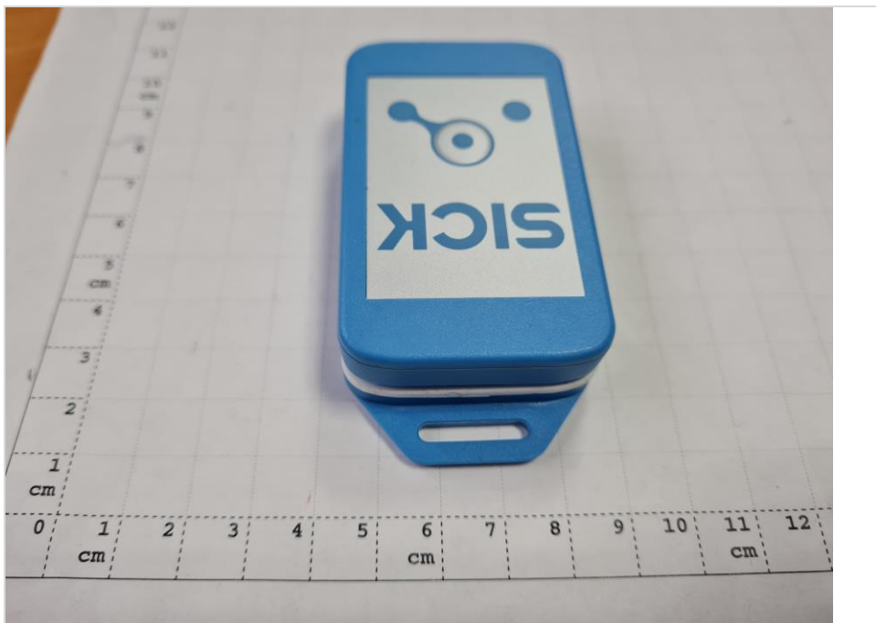
Photograph 6: EUT 01_back side view