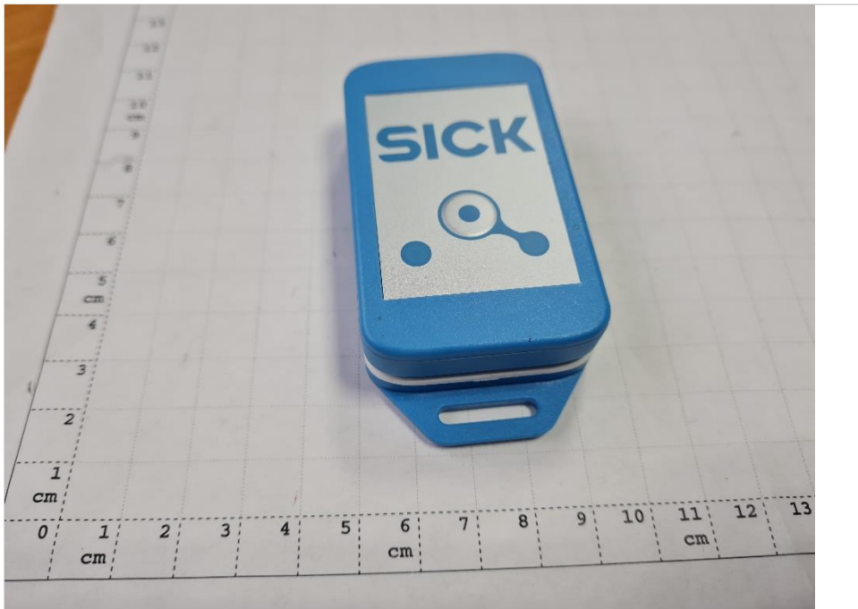
Photograph 5: EUT 01_front side view