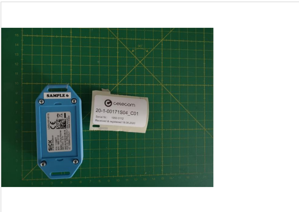
Photograph 2: EUT 01_Rear side view