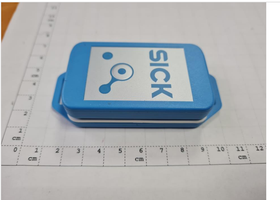
Photograph 4: EUT 01_Right side view