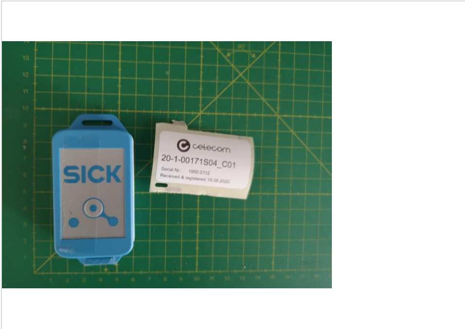
Photograph 1: EUT 01_Top view