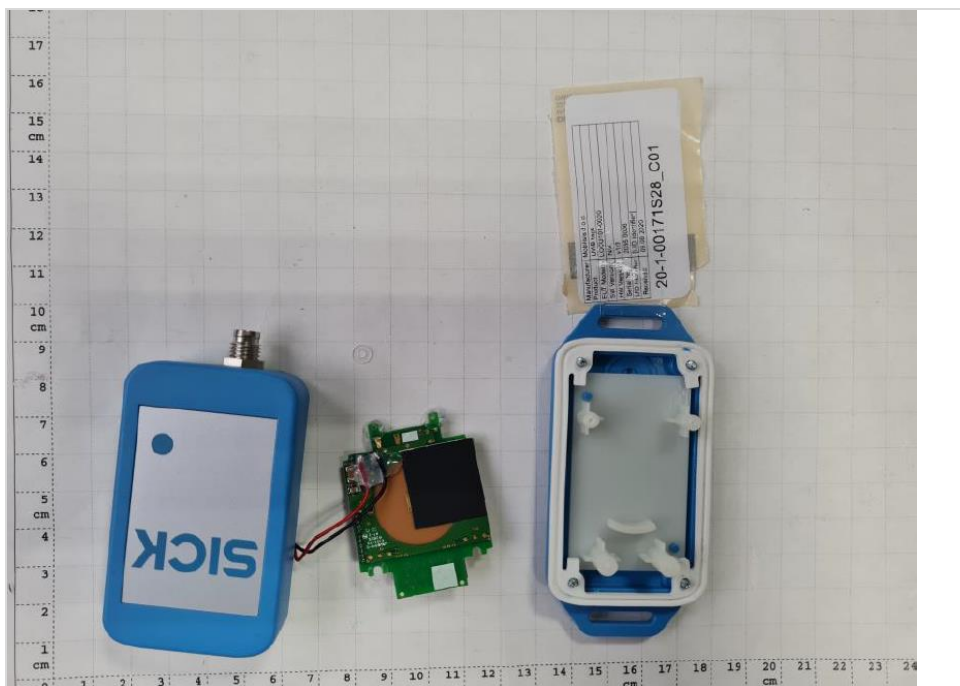
Photograph 4: EUT 1_Inside view 4