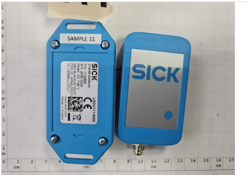
Photograph 2: EUT 1_Inside view 2