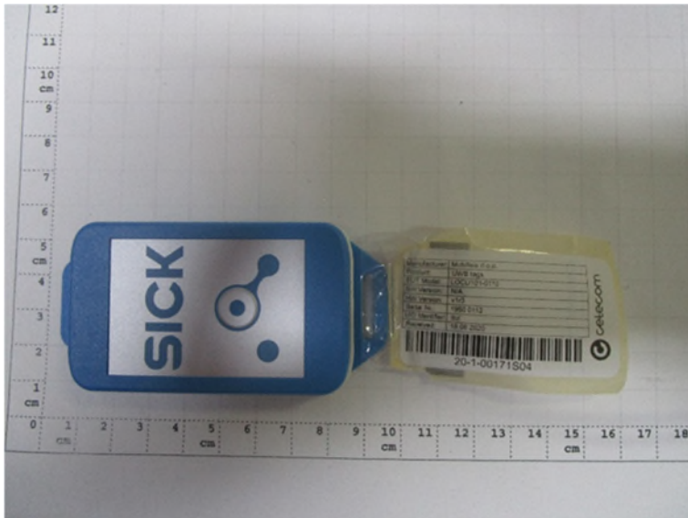
Photograph 1: EUT 1_Top view