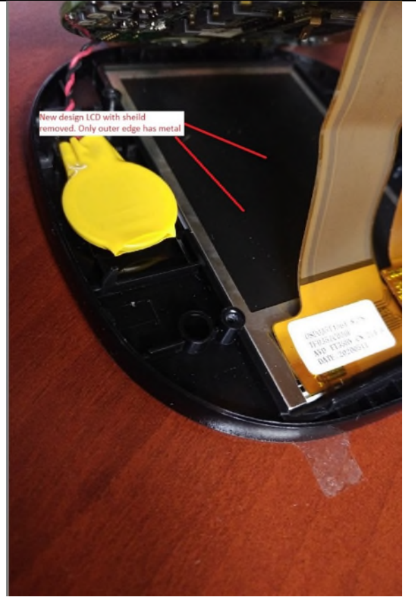
Figure 2 New Design with Shield Removed around LCD