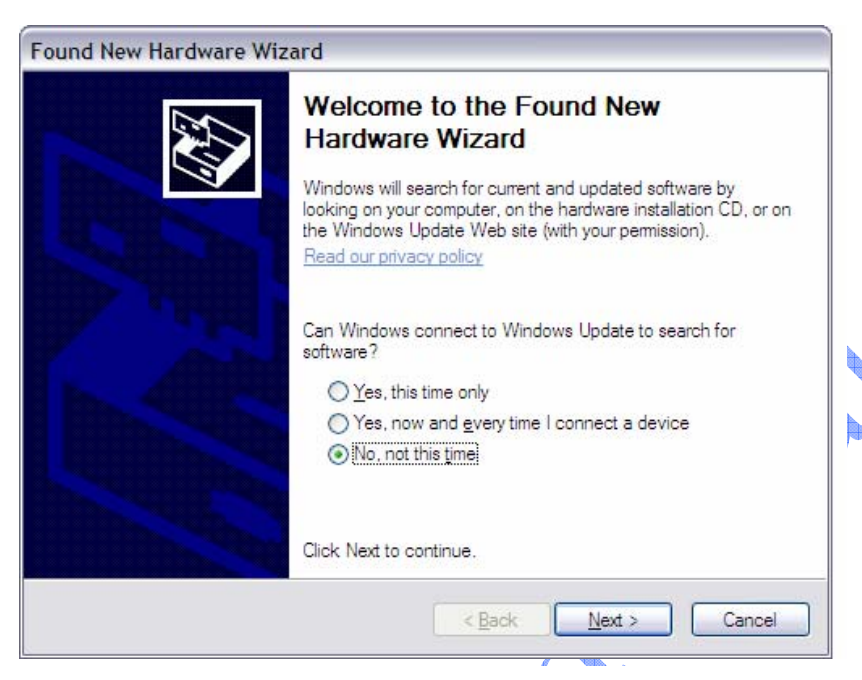
Figure #1: WLAN Driver Installation Window #1