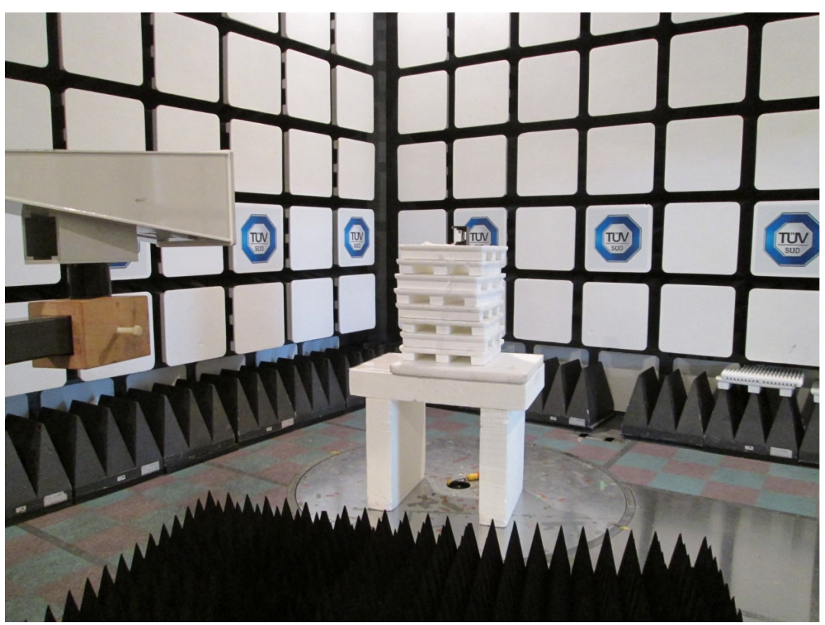
Figure 4 – Radiated Emissions Setup – Photo 4