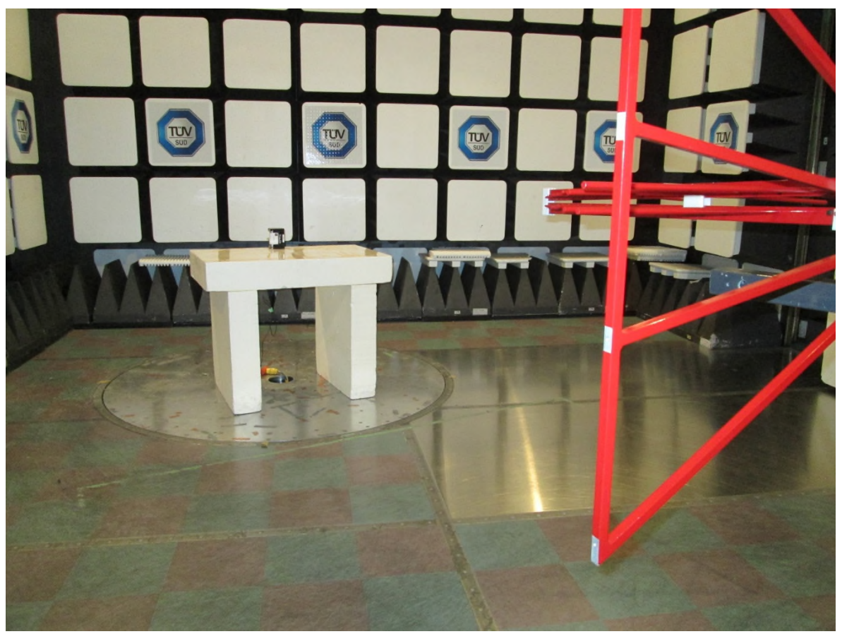
Figure 3 – Radiated Emissions Setup – Photo 3