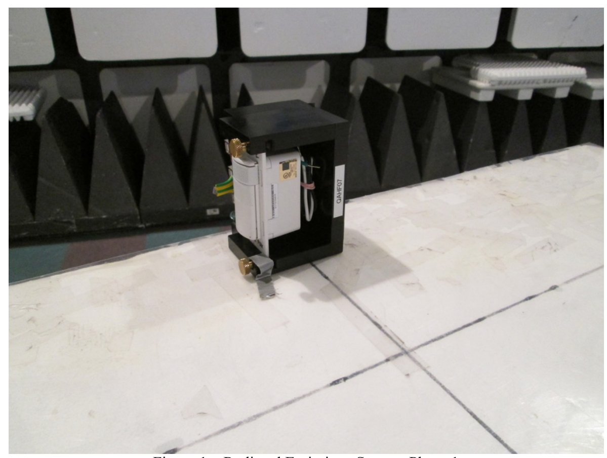
Figure 1 – Radiated Emissions Setup – Photo 1