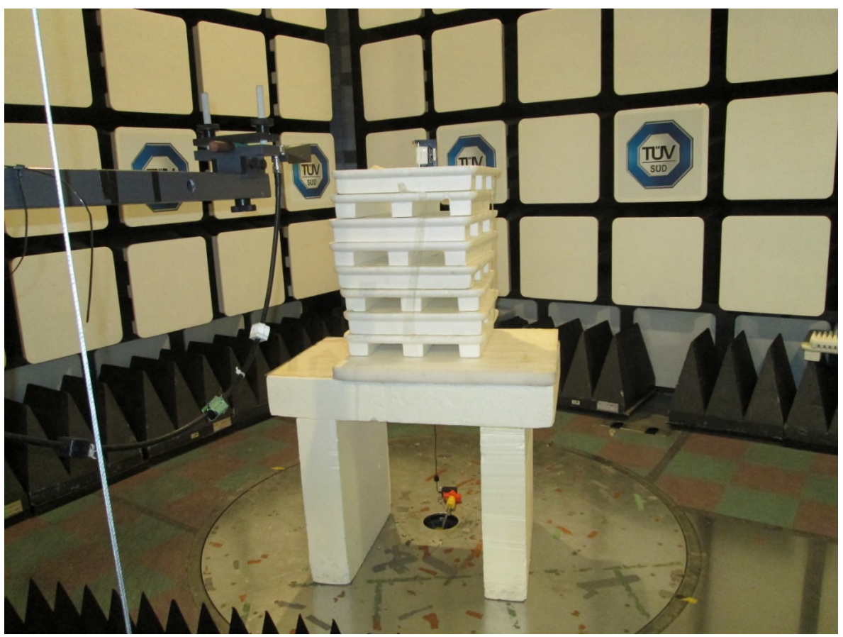
Figure 5 – Radiated Emissions Setup – Photo 5