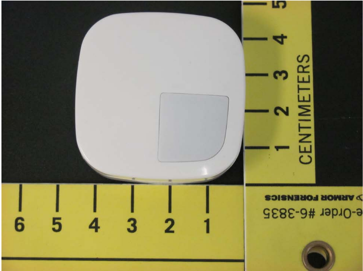
Illustration 1: EUT external front view