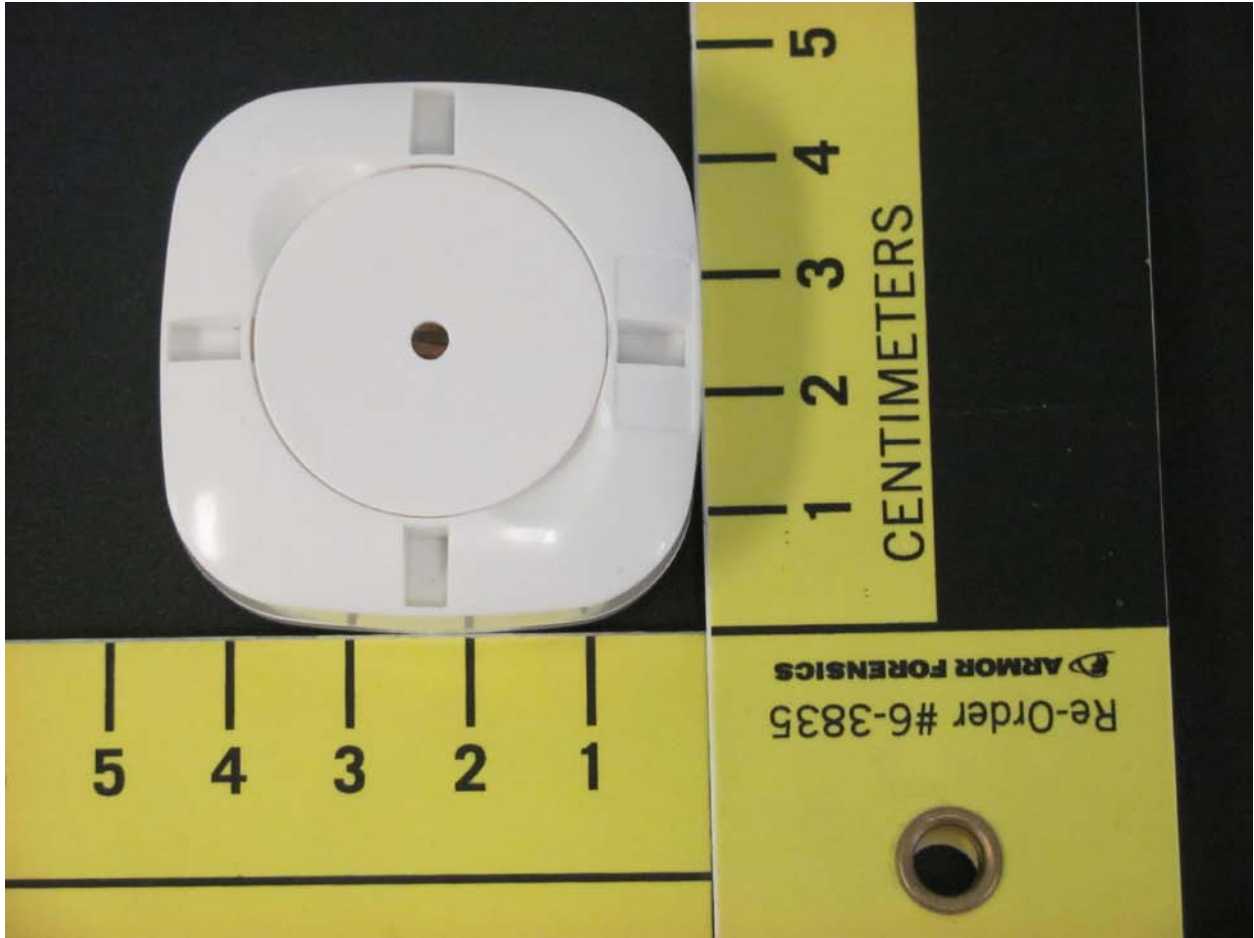
Illustration 2: EUT external rear view