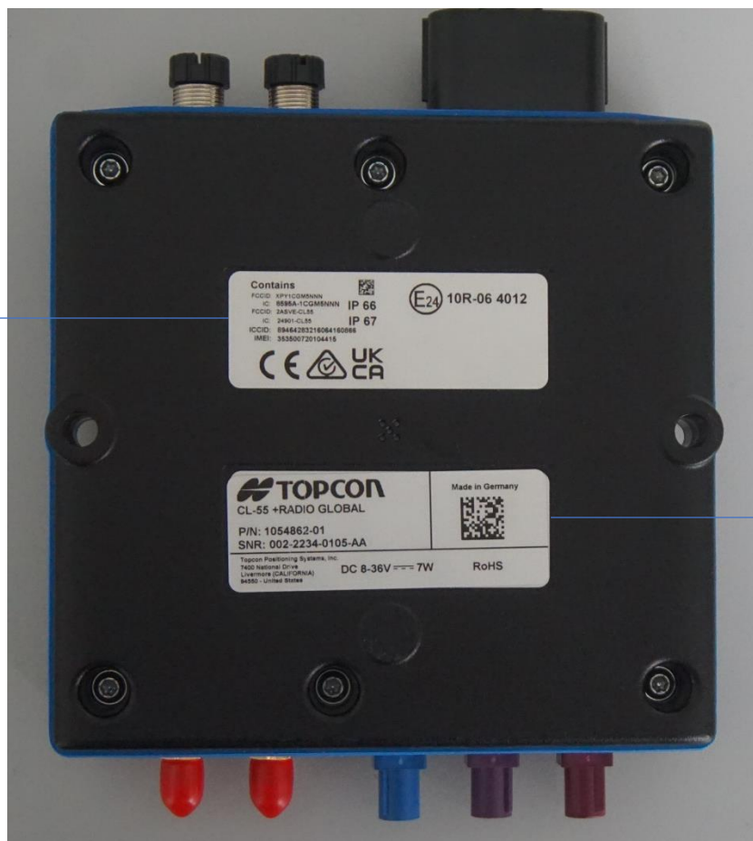
Compliance label (example)