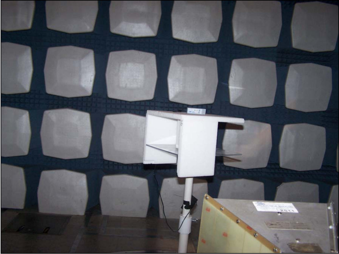
Photograph 1. Field Strength, Test Setup