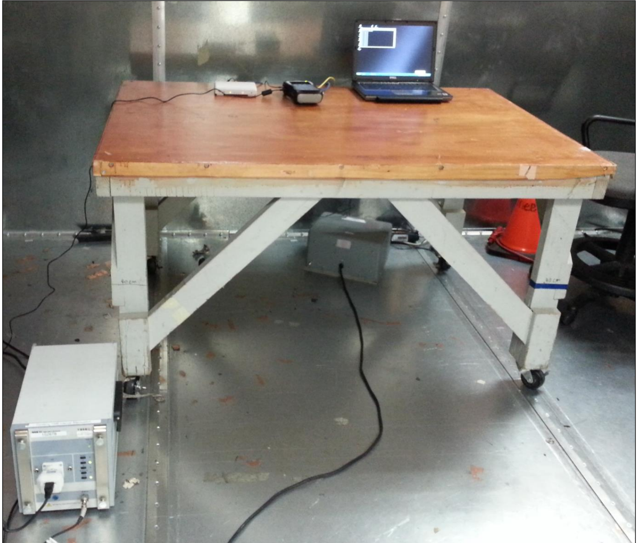
Photograph 5. Conducted Emissions, 15.207(a), Test Setup