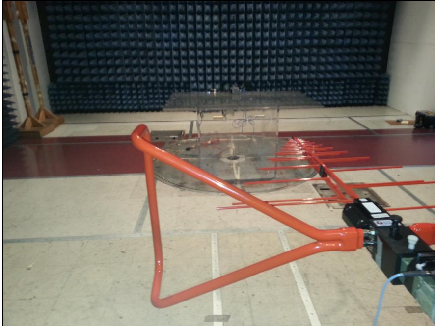
Photograph 2. Radiated Emissions, Test Setup, 30 MHz – 1 GHz