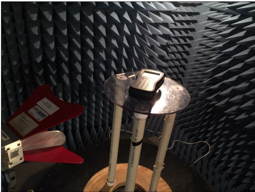
Photograph 6. Radiated Spurious Emissions, Test Setup Above 1 GHz