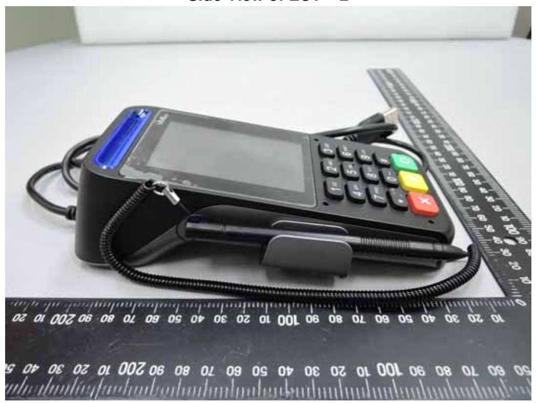
Side View of EUT - 3