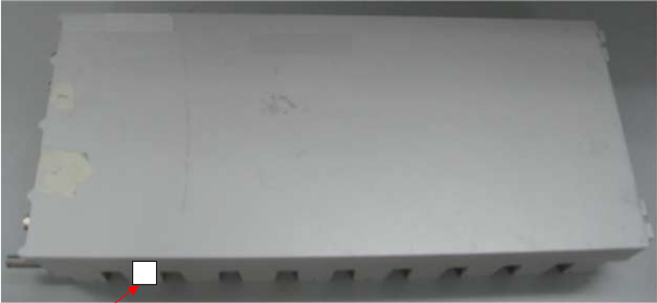
Label with FCC ID:WQE702502

A base station unit shall bear the label with FCC ID:WQE702502 on a side panel as shown in the photo below: