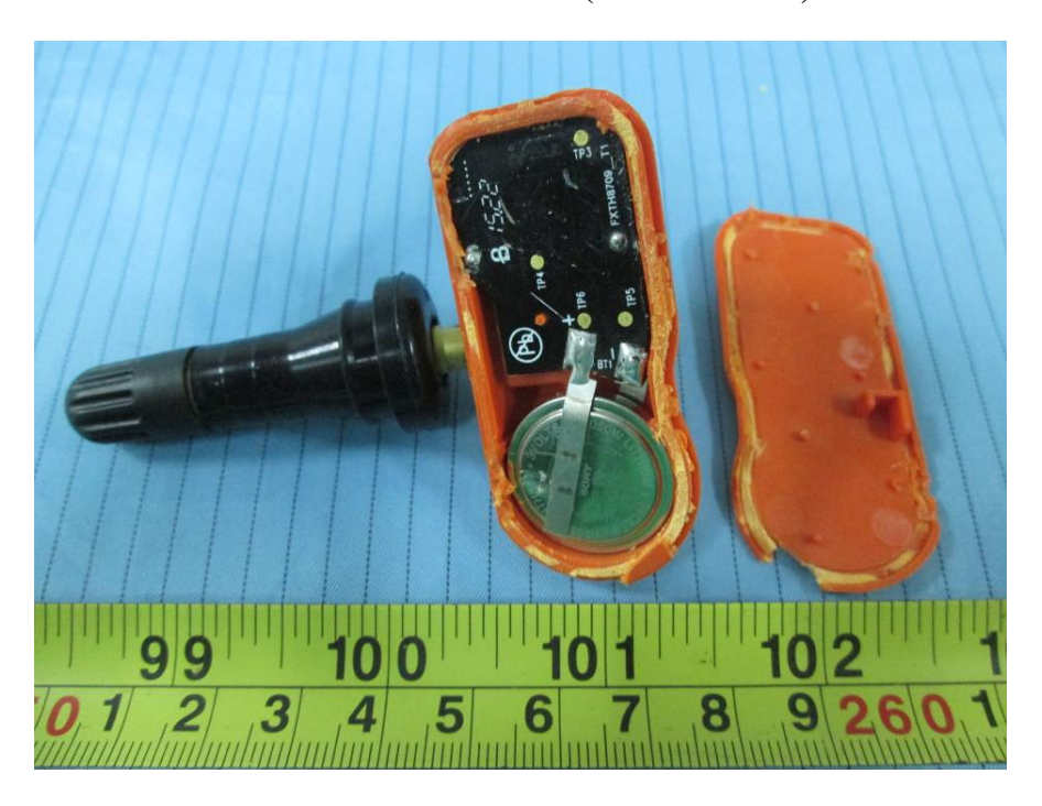
EUT - Cover off View 1 (Model: 8930C)