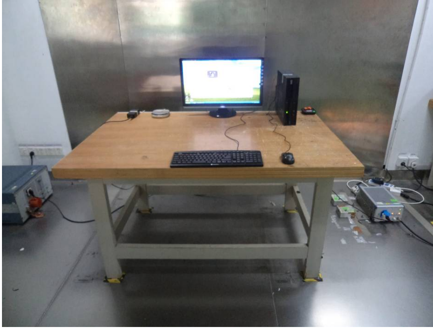
Conduction Emissions – Side View