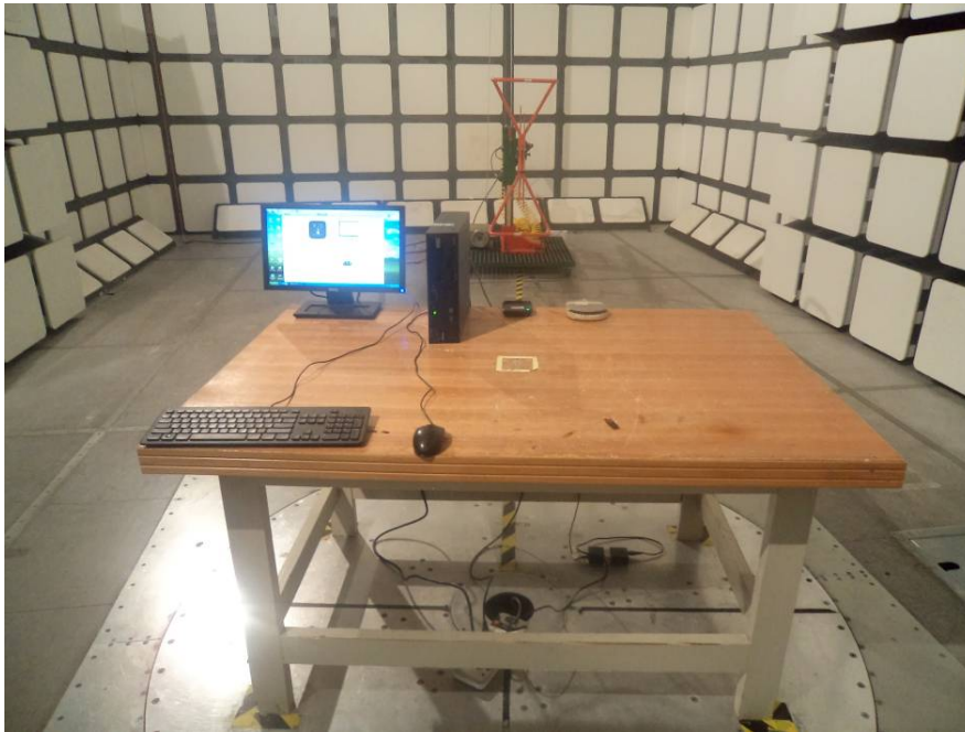
Radiated Emission – Rear View (30 MHz to 1 GHz)