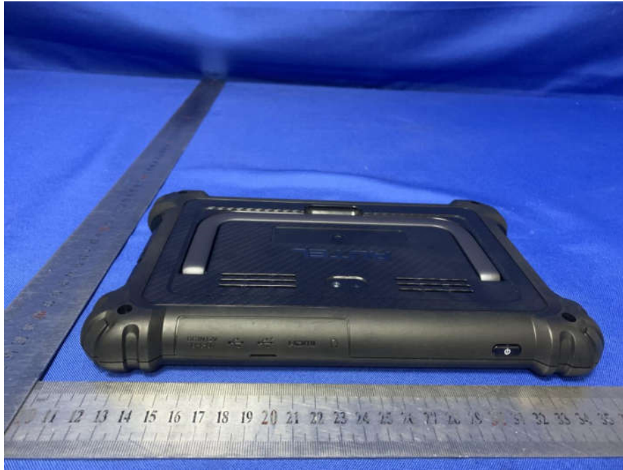
View of Product-9