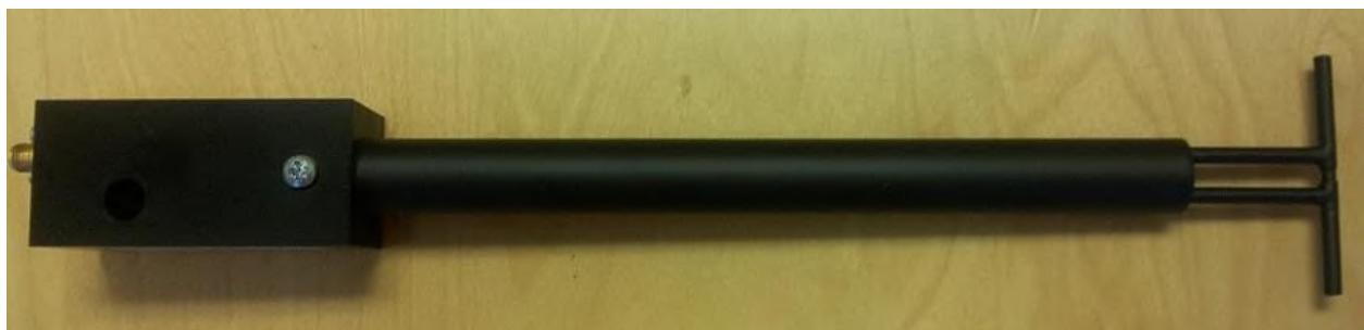
Figure 1 – MVG COMOSAR Validation Dipole

MVG’s COMOSAR Validation Dipoles are built in accordance to the IEC/IEEE 62209-1528 and FCC KDB865664 D01 standards. The product is designed for use with the COMOSAR test bench only.