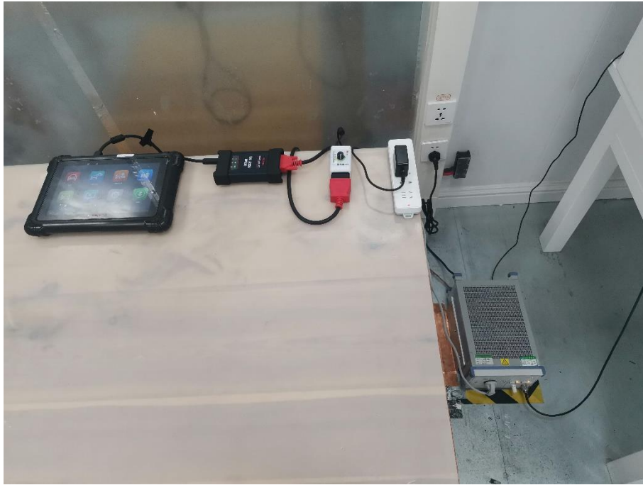
Photo of Radiation Emission Test