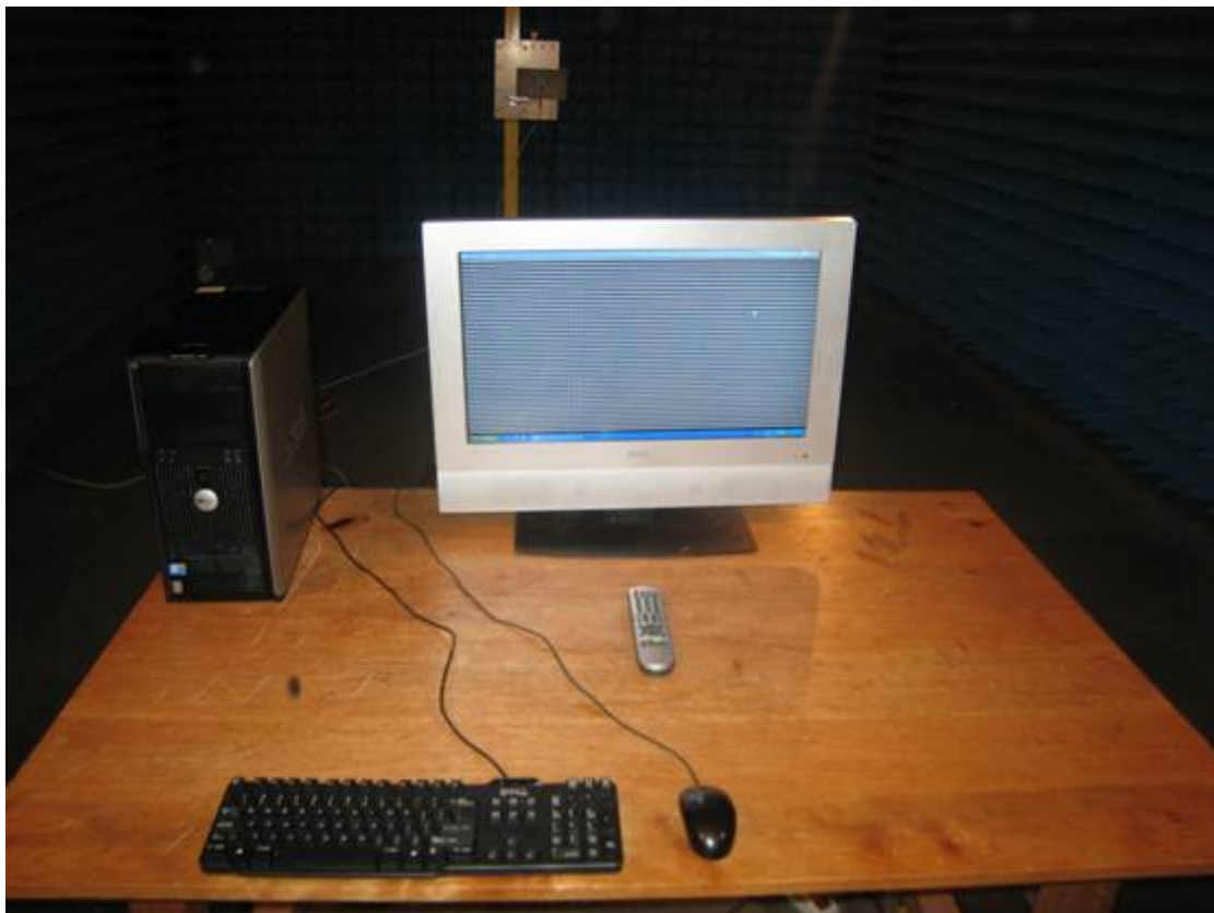
Test photo of radiated emission (1000MHz-5000MHz)