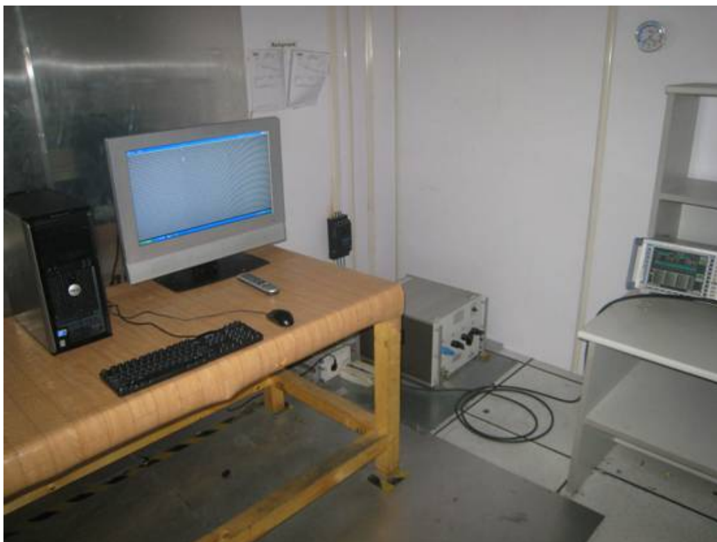
Test photo of Conducted emission