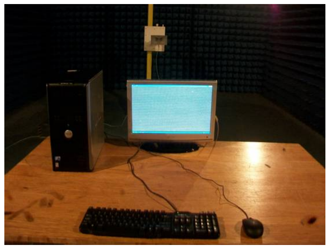
Test photo of radiated emission (1000MHz-5000MHz)