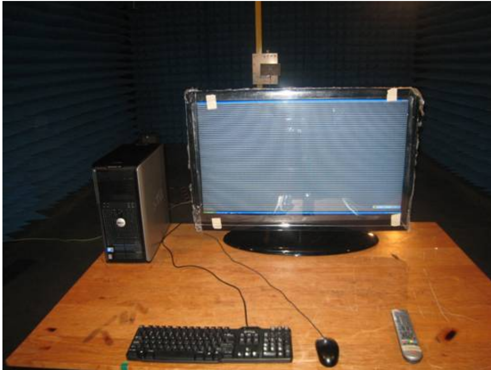
Test photo of radiated emission (1000MHz-5000MHz)