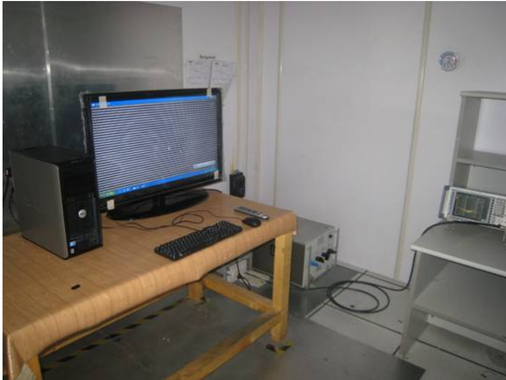
Test photo of Conducted emission