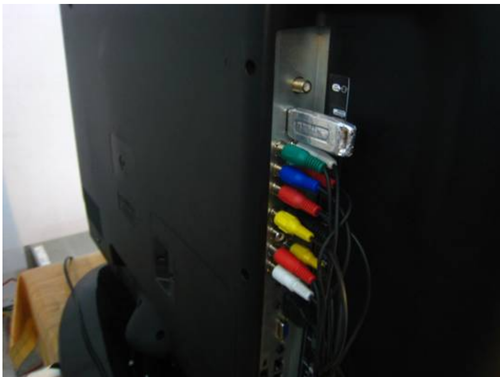
The test port