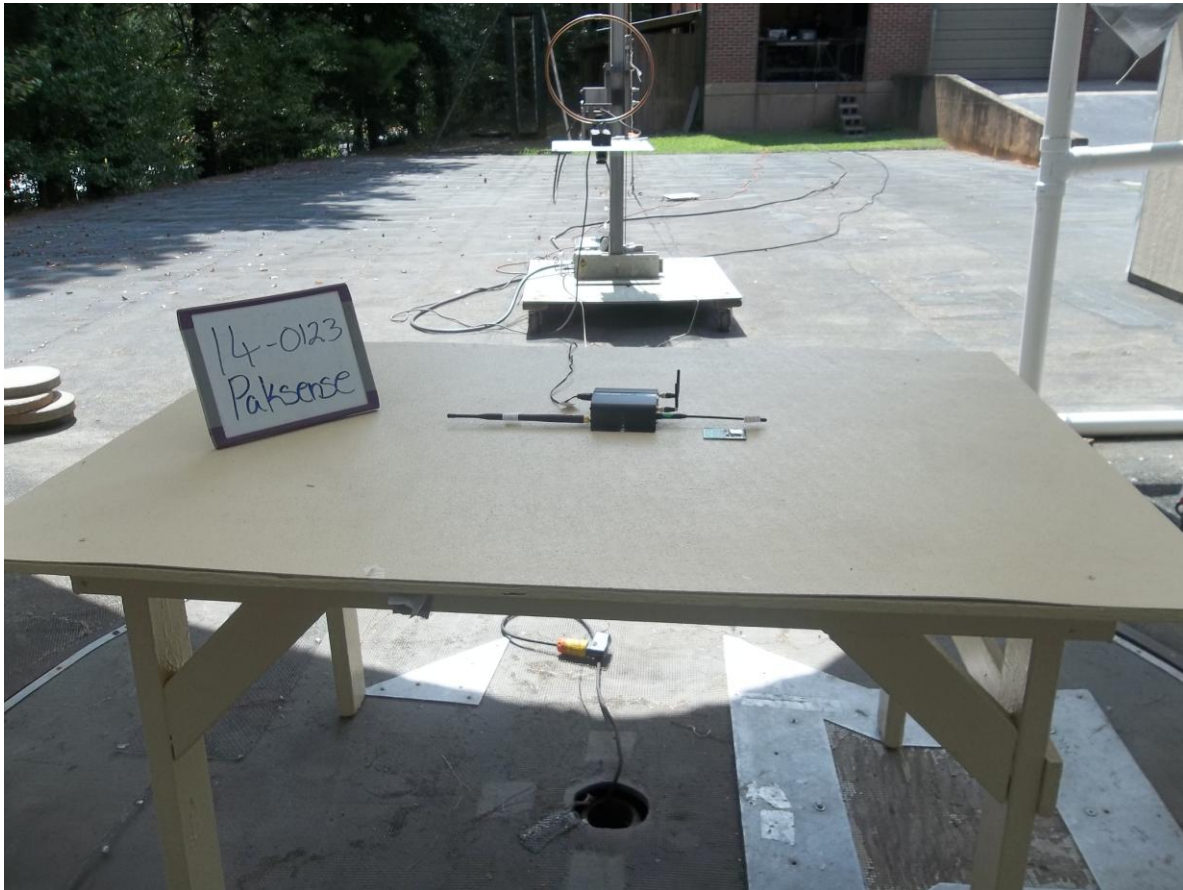
Photo 3- Radiated Emissions Test Setup, .15 MHz to 300 MHz, with RF Label, Back

FCC Part 15.247/ RSS 210 14-0123 September 8, 2014 PSASII-01 WPEPSASII-01 8031A-PSASII01 Paksense