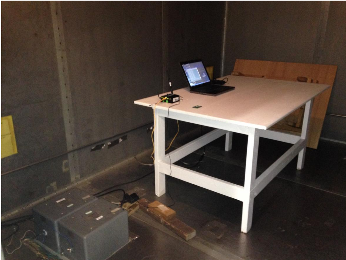
Photo 9- Conducted Emissions Test Setup, with RF Label

FCC Part 15.247/ RSS 210 14-0123 September 8, 2014 PSASII-01 WPEPSASII-01 8031A-PSASII01 Paksense