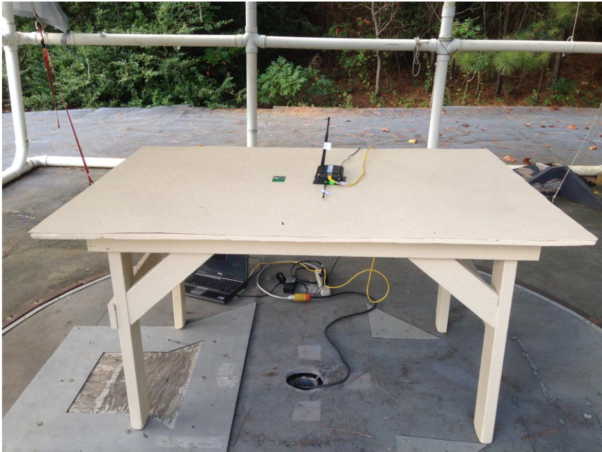
Photo 1- Radiated Emissions Test Setup, Front, with RF Label