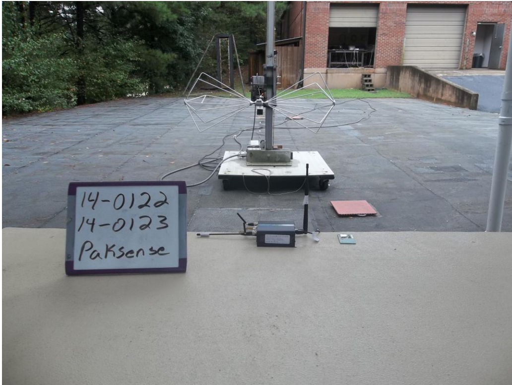
Photo 4- Radiated Emissions Test Setup, 30 MHz to 200 MHz, Back

FCC Part 15.247/ RSS 210 14-0123 September 8, 2014 PSASII-01 WPEPSASII-01 8031A-PSASII01 Paksense