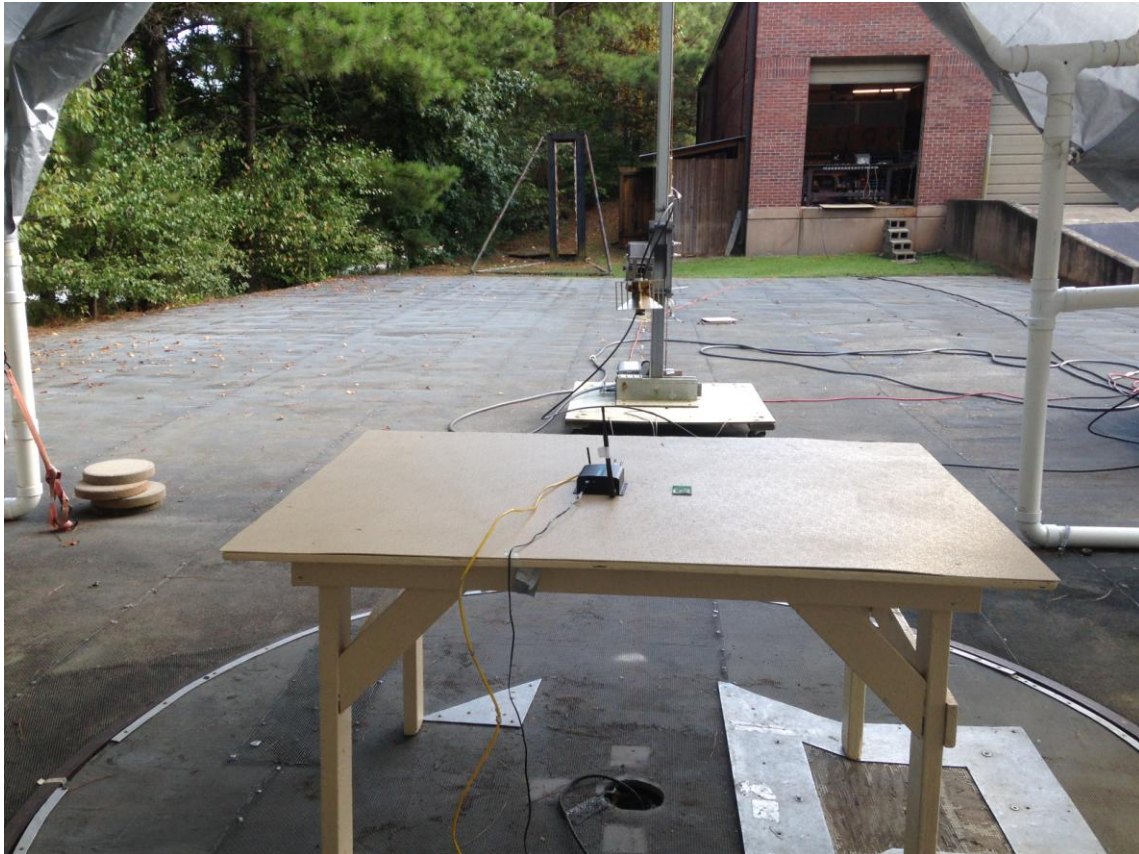
Photo 7- Radiated Emission Test Setup, above 1 GHz, with RF Label, Back

FCC Part 15.247/ RSS 210 14-0123 September 8, 2014 PSASII-01 WPEPSASII-01 8031A-PSASII01 Paksense