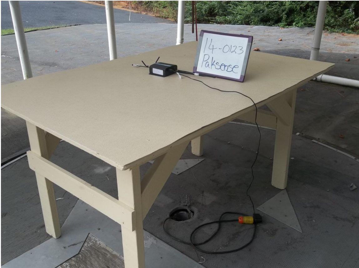
Photo 2- Radiated Emissions Test Setup, Front, without RF Label

FCC Part 15.247/ RSS 210 14-0123 September 8, 2014 PSASII-01 WPEPSASII-01 8031A-PSASII01 Paksense