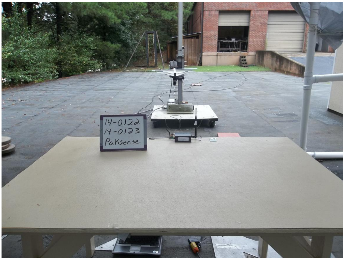
Photo 5- Radiated Emissions Test Setup, 200 MHz to 1GHz, with RF Label, Back

FCC Part 15.247/ RSS 210 14-0123 September 8, 2014 PSASII-01 WPEPSASII-01 8031A-PSASII01 Paksense