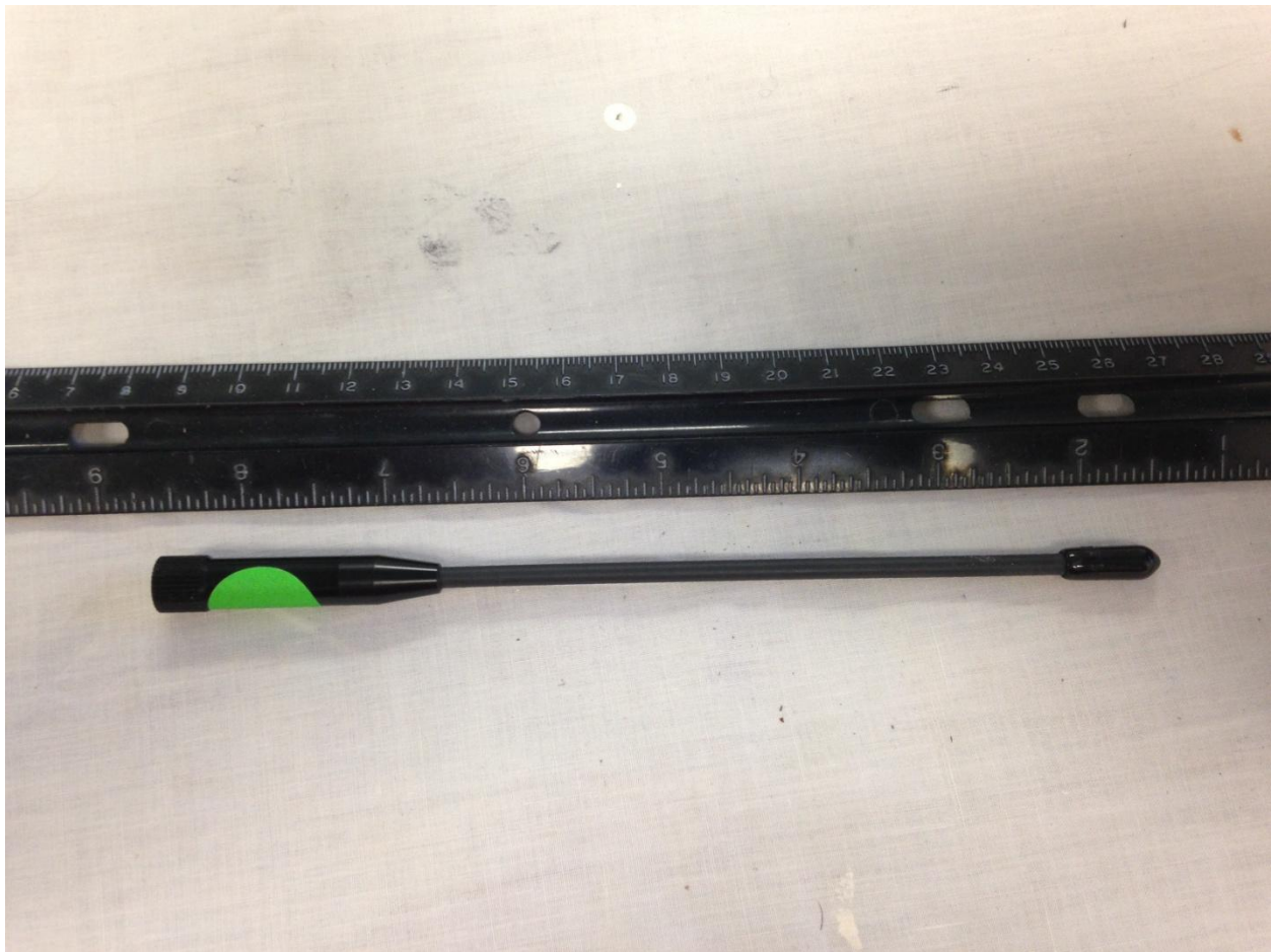
Figure 1. Antenna for Paksense Radio

MFG: Nearson Type: Omni Directional Dipole antenna Gain: 2.0 dBi Connector: Reverse sex SMA connector