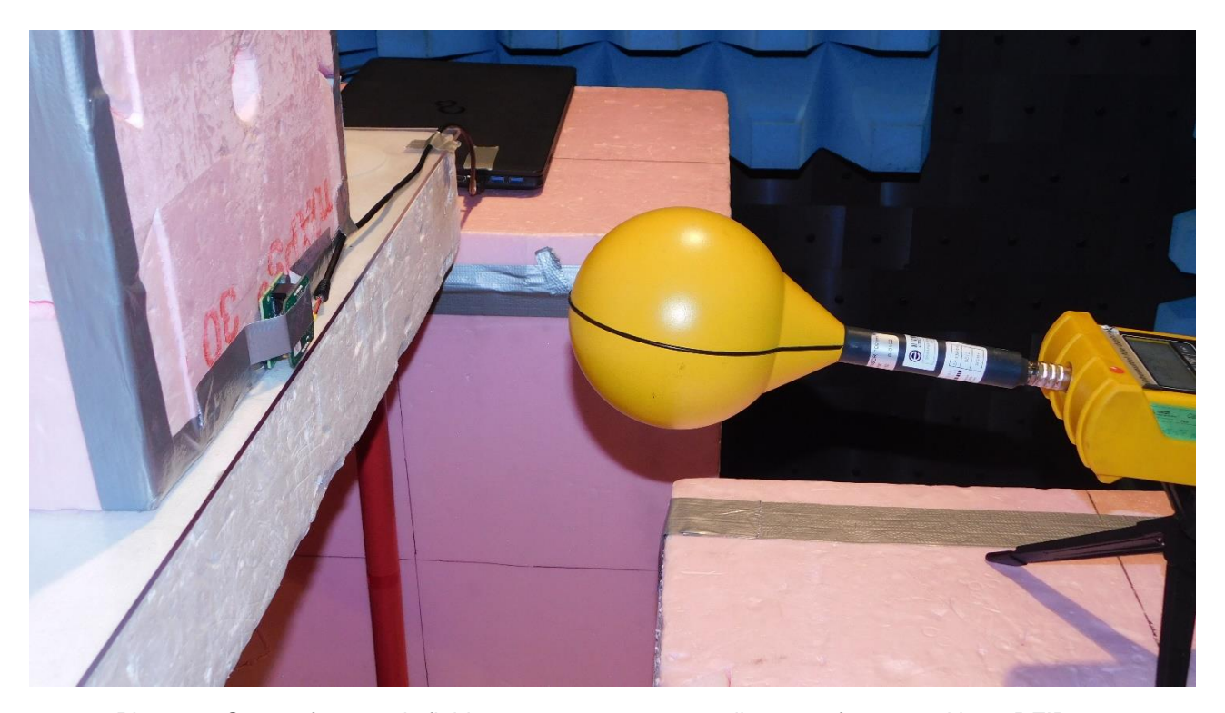
Picture 1: Setup of magnetic field test at a measurement distance of 20 cm, without RFID tag