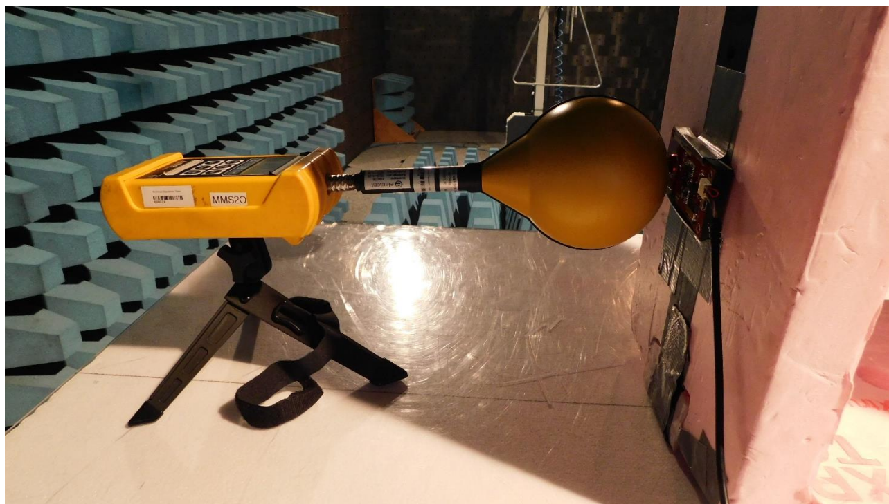
Picture 1: Setup of magnetic field test at a measurement distance of 0 cm