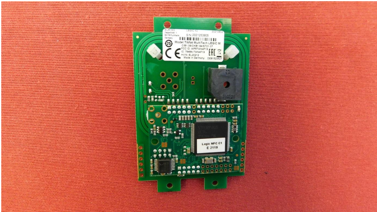
Item 1: Name plate of EUT