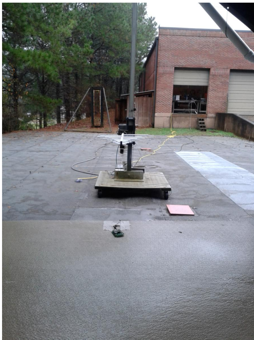
Figure 3. Radiated Emissions Test Setup, 200 MHz - 1000 MHz

FCC Part 15 Certification/ RSS 210 WP5TWN4F1 7948A-TWN4F1 15-0269 December 23, 2015 Elatec TWN4 Mifare NFC