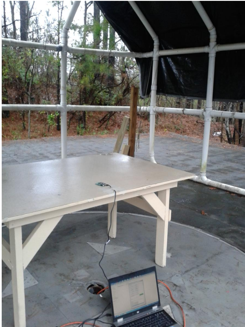
Figure 1. Radiated Emissions Front View