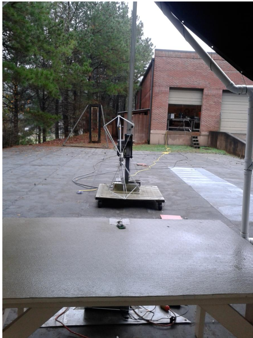
Figure 2. Radiated Emissions Test Setup, 30 MHz- 200 MHz

FCC Part 15 Certification/ RSS 210 WP5TWN4F1 7948A-TWN4F1 15-0269 December 23, 2015 Elatec TWN4 Mifare NFC