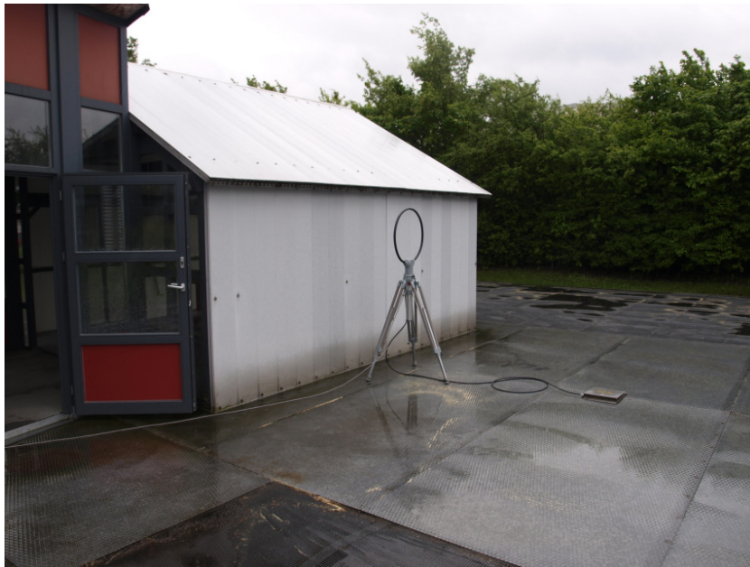
Picture 4: Loop antenna in open site 3m for spectrum mask and radiated emission test