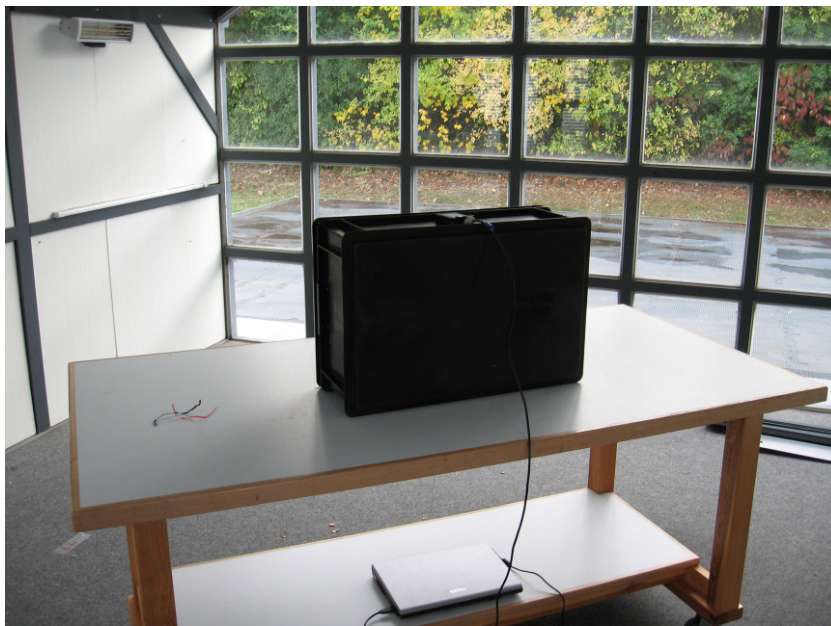
Picture 5: EUT test setup open site for spectrum mask and radiated emission test