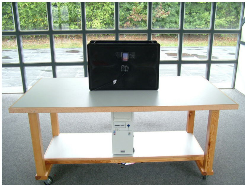
Picture 1-2: EUT test setup open site for spectrum mask and radiated emission test