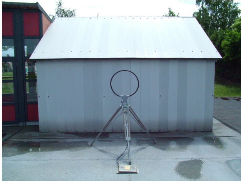
Picture 1-1: Loop antenna on open site 3m for spectrum mask and radiated emission test